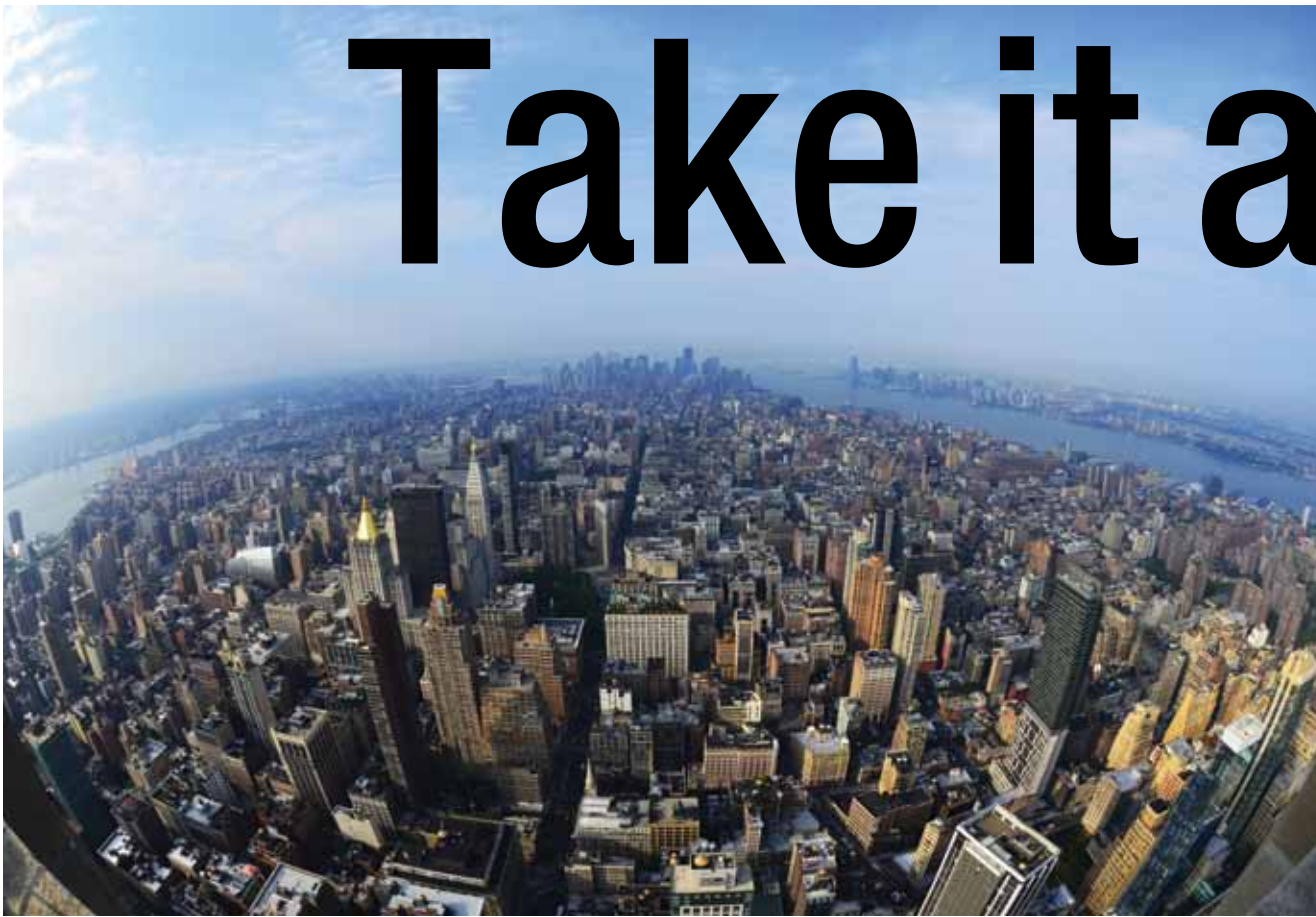
Exhibit hall opens its doors for the 88th annual Greater New York Dental Meeting