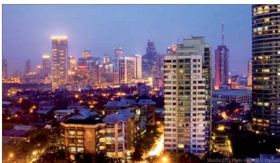
Manila