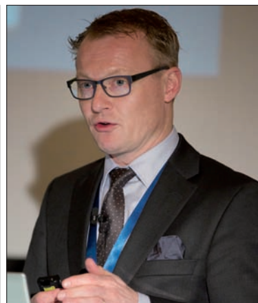
Fig. 4: Prof. Pekka Vallittu