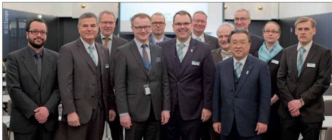
• Fig. 1: GC “family” posing with CEO Makoto Nakao.

Another crowd puller was GC’s new Fuji IX GP EXTRA, an improved, self-curing, conventional glass ionomer filling material. Thanks to its next generation glass fillers, restorations