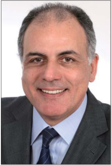
By Dr Roy Sabri, Lebanon

The anatomy of the smile is an integral part of modern dental practice. The various components that make up a balanced smile should be understood and patient's smile properly recorded and analysed so that desirable aspects are maintained and unpleasant components addressed.