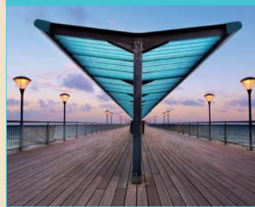
Peer to pier The BOS Conference 2012