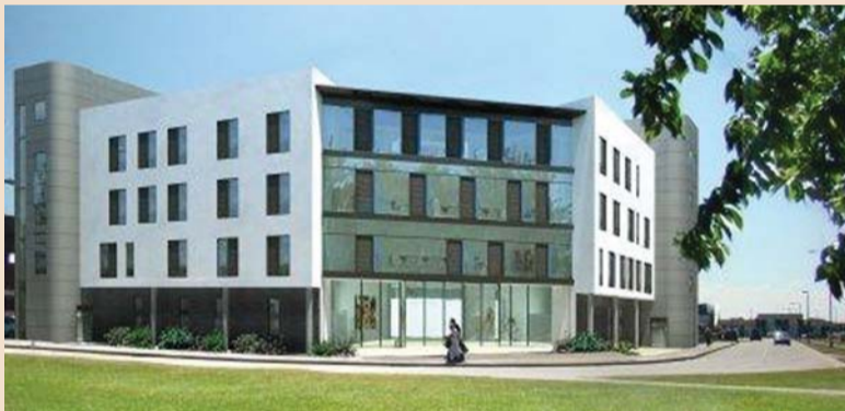
New health centre charges 'ridiculous' rent

A dentist is being forced out of his practice in Bransholme, Hull because of a 'ridiculous' rent charge at a new health centre.