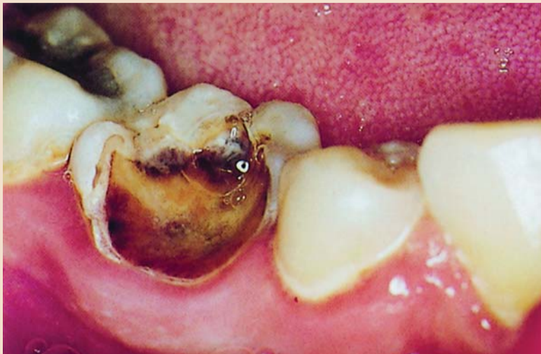
More than a third of adults are more likely to delay any dental treatment needed due to cost

A growing number of people are cutting back on their oral healthcare as household budgets continue to be squeezed.