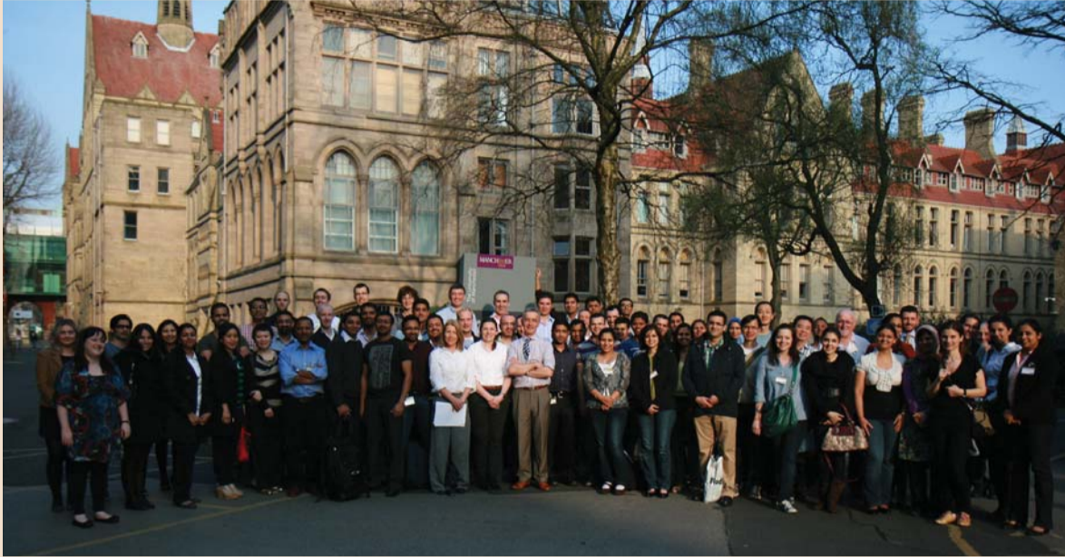
The MSc cohort gather for a group photo at the Manchester residential