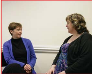
In the zone DT looks at dental nursing education