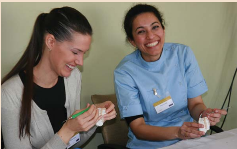
Students enjoy one of the hands on sessions.