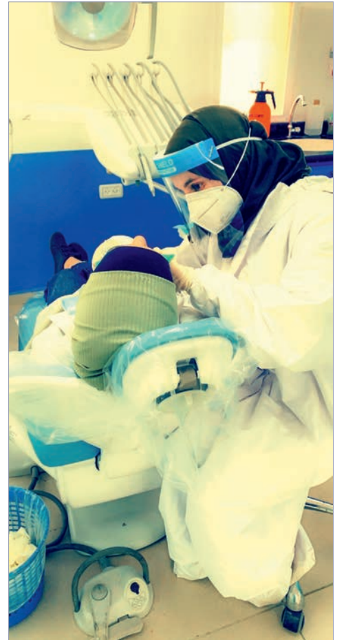
■ In a survey of 488 dentists practising in the West Bank area in Palestine, 60% said that they felt unprepared to reopen their dental clinics after the first lockdown in 2020.