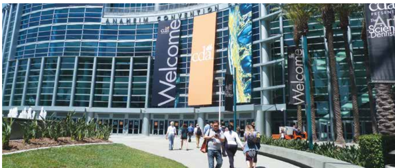
Attendees enter the Anaheim Convention Center during the 2017 CDA Presents The Art and Science of Dentistry.

■ It's a little later in the year than the past few years, but the wait is finally over.