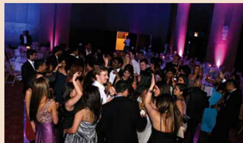
Guests party the night away at the AOG ball