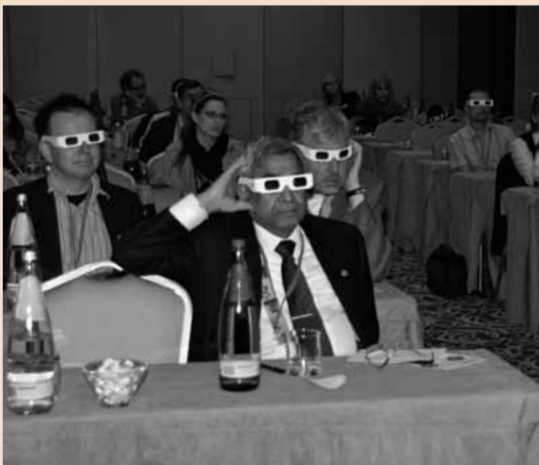
Innovation in practice