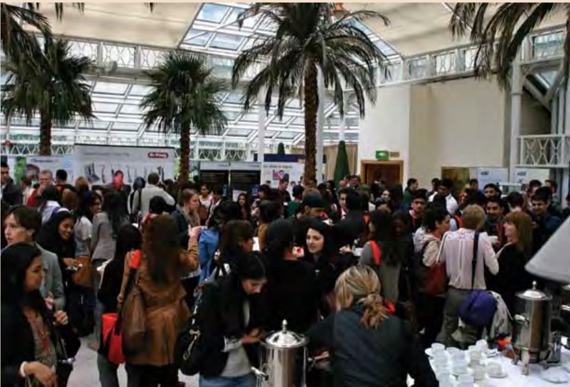
Delegates and exhibitors mingle