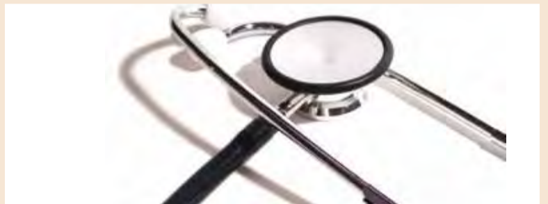
It has been agreed that GPs should be spared the fee to register with CQC

which GP practices to inspect and reiterated its belief that registration was a bridge too far. DT