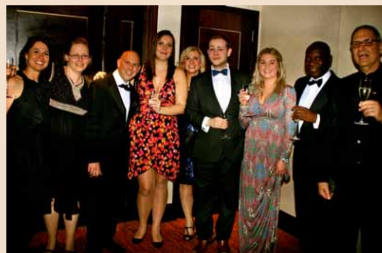
Well done to the Smile-on team