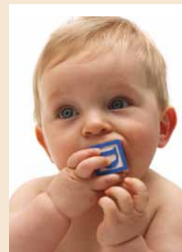
The key to a healthy smile lies in habits formed during infant years