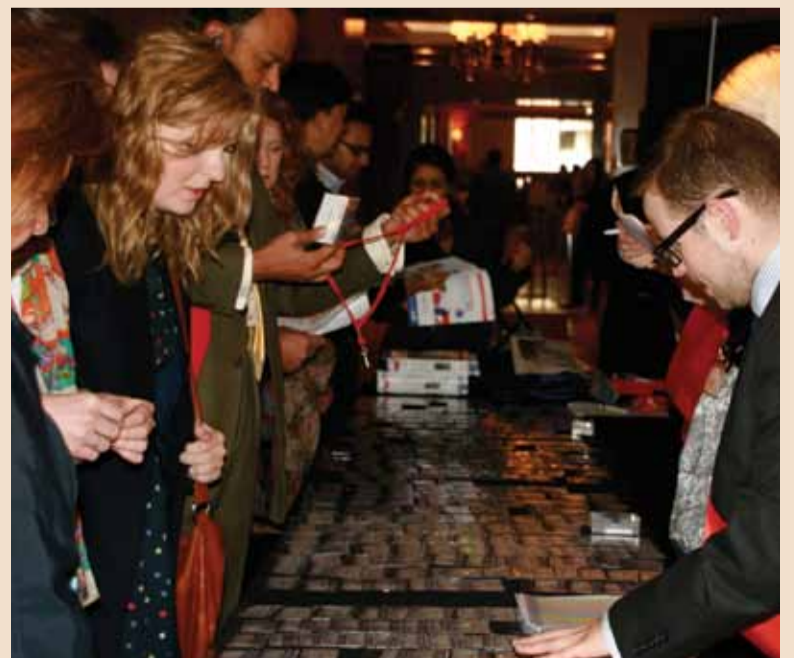
Visitors receive their passes and day programmes