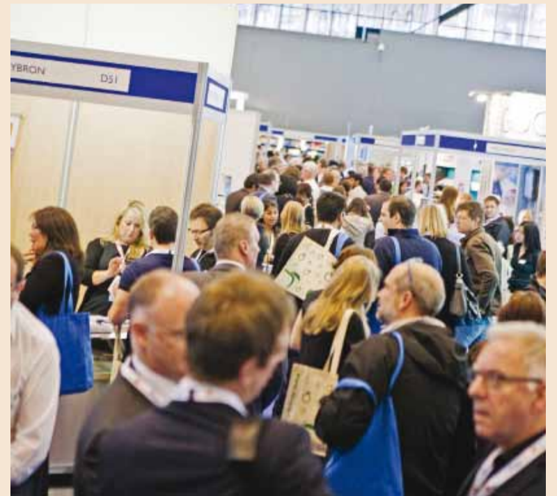
Delegates at the British Dental Conference and Exhibition

On Thursday the entertainment begins at 18:00 at the Central Hall with the exhibition hall drinks reception as the BDA hosts a get together to celebrate the opening day of the event!