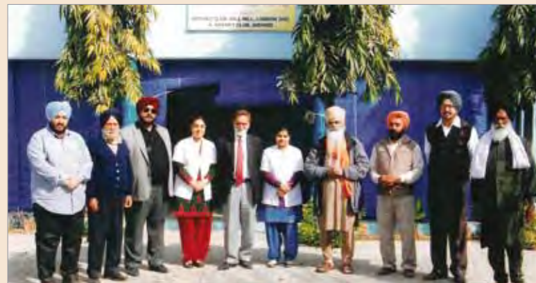
The team at the Pain Relief Clinic

'I can verify completely that every penny we get is spent on the clinic; not a penny is wasted'