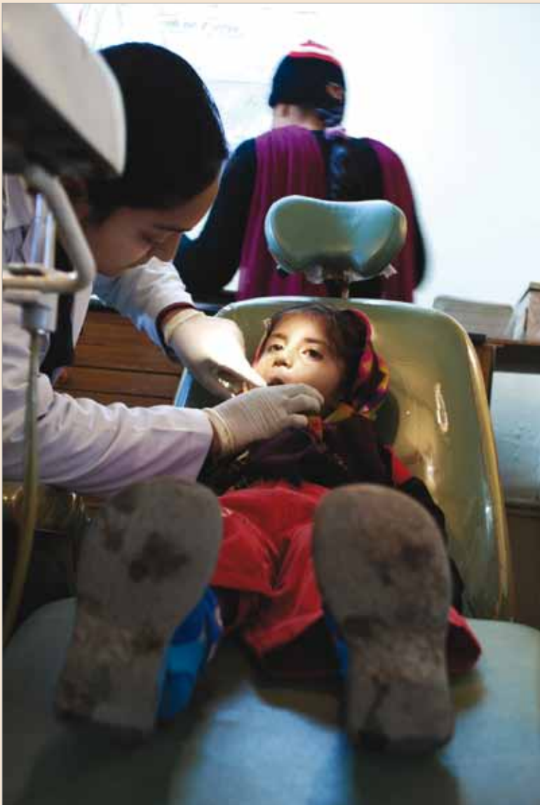
All treatments supplied to patients is free

Dental Tribune interviews the founders of the Pain Relief Clinic in Hansali