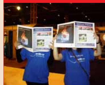
Showcase Preview A look at this year's BDTA dental showcase