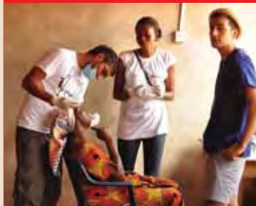
Outreach programme Dental students travel to Ghana