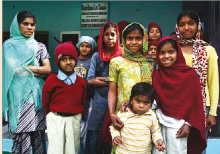
Visitors to the clinic