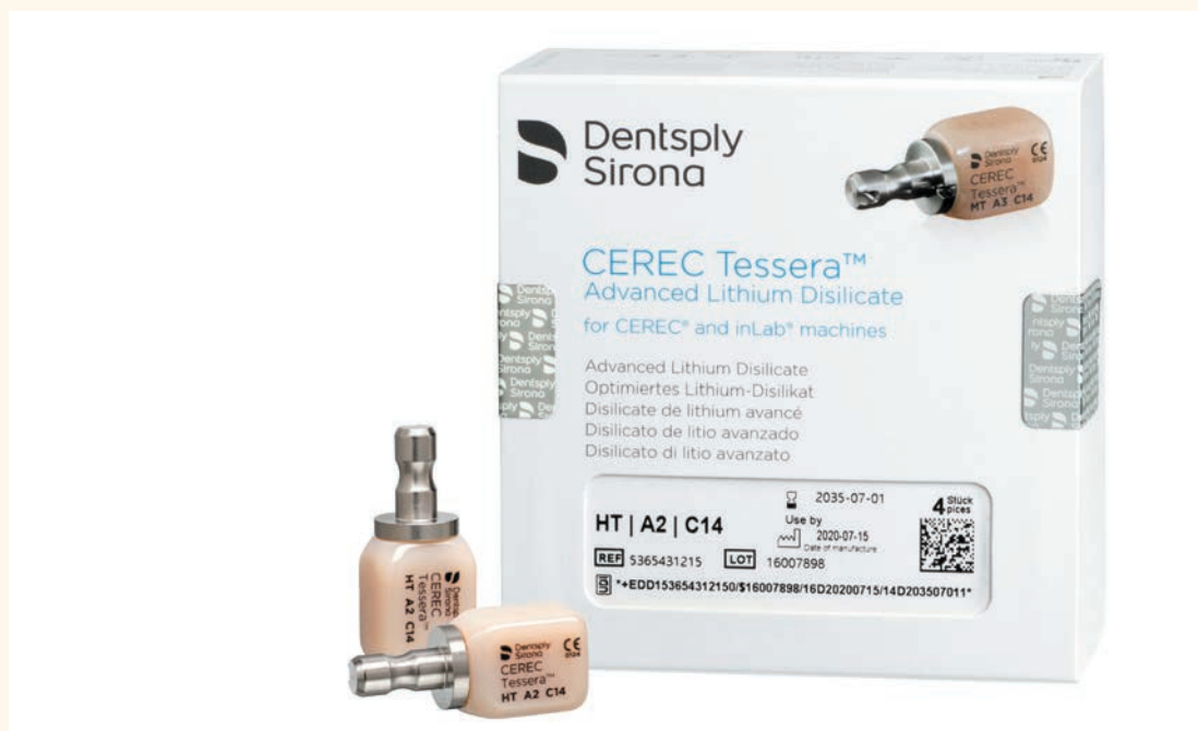
With high strength, sophisticated aesthetics and fast processing, CEREC Tessera blocks open up new possibilities for patient care in a single visit.