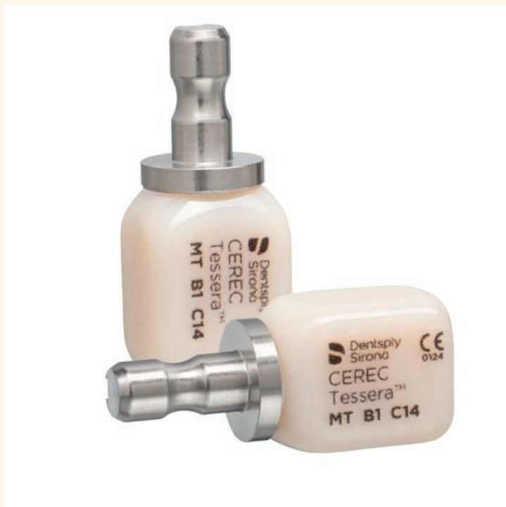
Glaze firing of CEREC Tessera blocks takes just four and a half minutes in the CEREC SpeedFire, which reduces the overall fabrication process time.