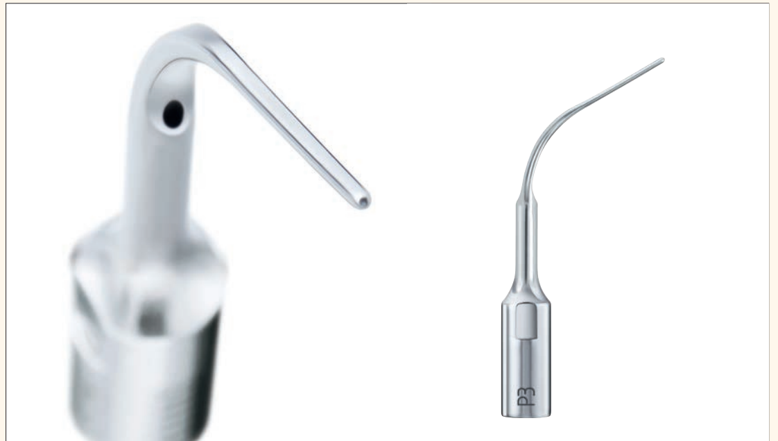
P3—the new full-scope maintenance insert

mectron S.P.A. via Loreto 15/A, 16042 Carasco (Ge), Italy, Web: www.mectron.com Email: mectron@mectron.com