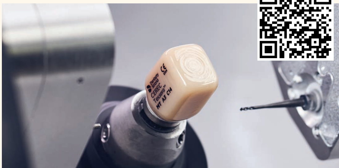
CEREC Tessera is an advanced lithium disilicate ceramic for the CEREC workflow that can be excellently processed in the CEREC Primemill.

The high-strength nature of CEREC Tessera blocks further provide clinical benefits via low minimal wall thickness preparation guidelines and the ability to use conventional cementation. All CEREC Tessera restorations can be fixed adhesively (for example with Prime&Bond and Calibra Ceram). Restorations with a wall thickness of 1.5 mm can also be conventionally cemented with a glass ionomer or hybrid glass ionomers (for example Calibra Bio).