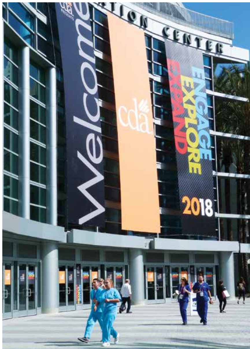
Attendees head into the Anaheim Convention Center during a past CDA Presents The Art and Science of Dentistry. This year's meeting goes until Saturday.

most respected functionally directed programs in dentistry. The lecture starts at 8:30 a.m. Friday.