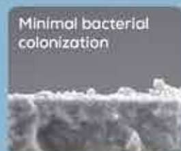
Minimal bacterial colonization

*8-Year independent clinical study recorded 100% retention rate, no secondary caries, failures, or postoperative sensitivity.