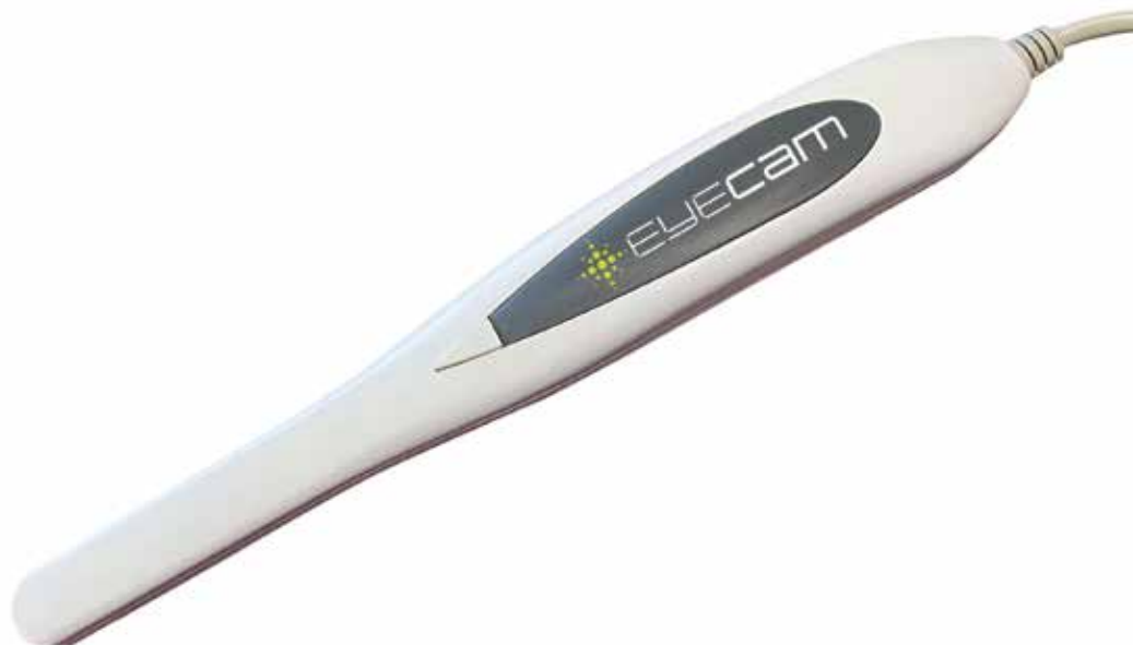
• The new EyeCam.

More information will be available at Shofu's booth, No. 1128.