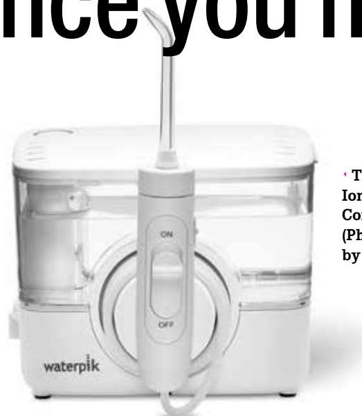
• The Waterpik Ion Professional Cordless Model.

Waterpik is considered to be the No. 1 recommended water flosser brand, according to the company, and it is clinically proven and accepted by the American Dental Association.