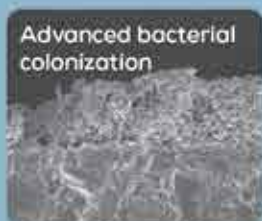
Advanced bacterial colonization