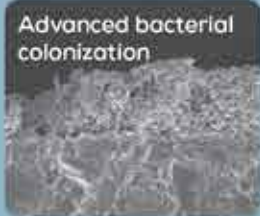
Advanced bacterial colonization