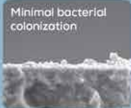
Minimal bacterial colonization

*8-Year independent clinical study recorded 100% retention rate, no secondary caries, failures, or postoperative sensitivity.