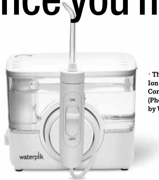
• The Waterpik Ion Professional Cordless Model.

higher settings, research has shown that even on the highest pressure settings, the Waterpik Water Flosser is safe on the gingival tissue and epithelial attachment.