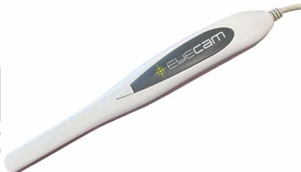
• The new EyeCam.

More information will be available at Shofu's booth, No. 1128.