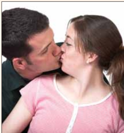
Know whom you are kissing, says the AGD.