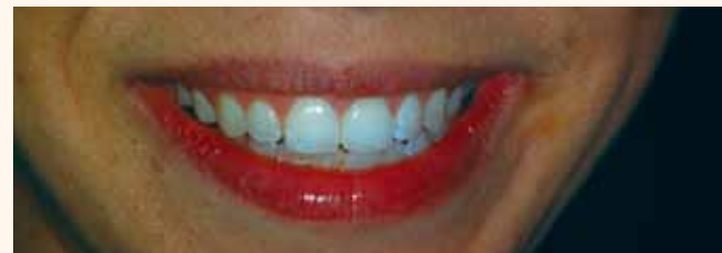
Fig. 2 Botox used to reduce maxillary gingival excess in a one-minute appointment.