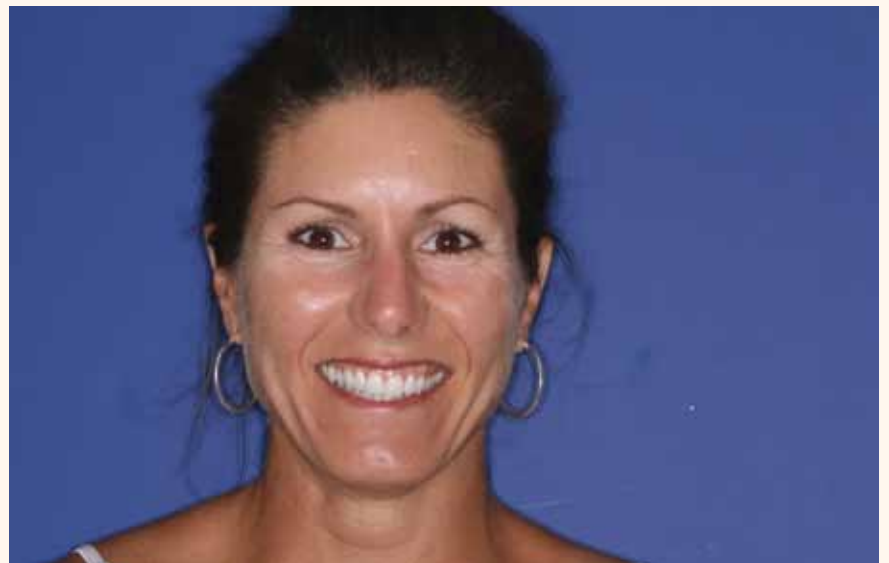
Fig. 5 Facial wrinkles, deep nasolabial folds and gummy smile are the patient's chief complaints