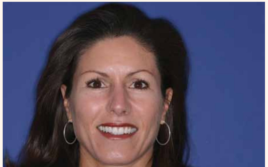
Fig. 6 A 15-minute appointment using Botox and dermal fillers achieves excellent dental esthetics.