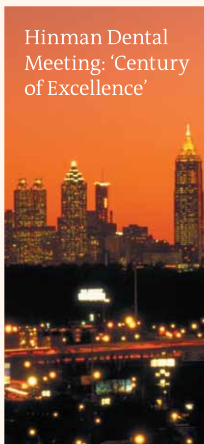
At least 23,000 dental professionals are expected at the 100th Thomas P. Hinman Dental Meeting, March 22–24, at the Georgia World Congress Center in Atlanta.