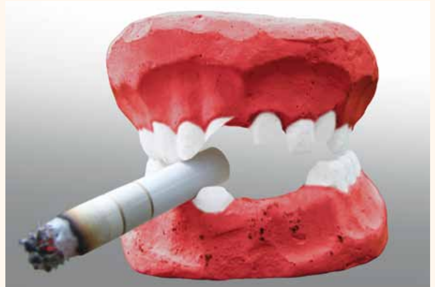
The Centers for Disease Control and Prevention reports that far more smokers than nonsmokers say 'cost' is why they don't see a dentist. The percent saying 'fear' is the main reason are identical regardless of smoking history. Photo/Dignity, www.dreamstime.com

(Source: Centers for Disease Control and Prevention)