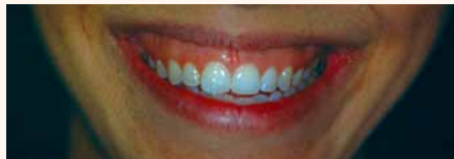
Fig. 1 Patient complains of her gummy smile.

Most dentists are familiar with this connection as being how oral health affects systemic health. I'm going to look at the oral-systemic connection from a completely different angle —