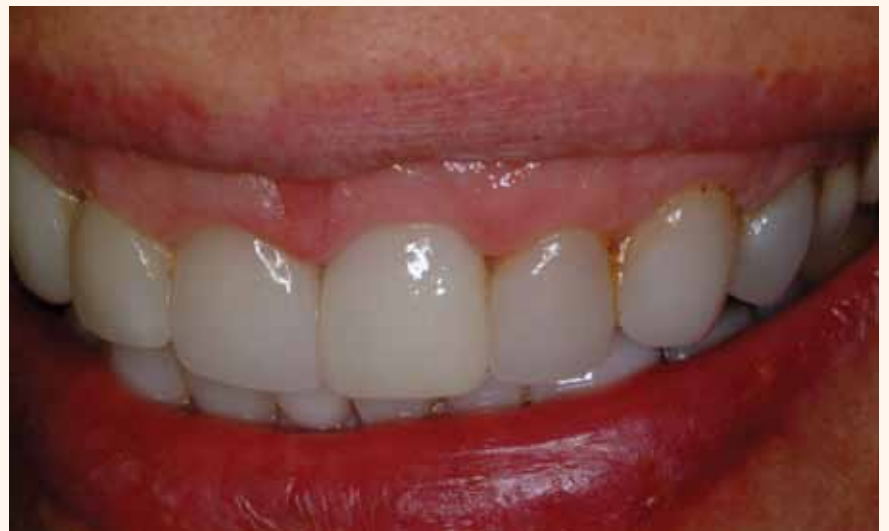
Fig. 4 Innovative use of a dermal filler used intra-orally to eliminate the black triangle in a five-minute appointment