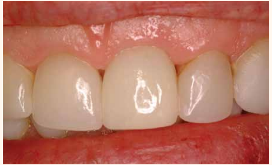
Fig. 3 An obliterated interproximal papilla because of implant surgery

The hottest topic in dentistry right now that will influence dentistry for the rest of your career is the integration of Botox and dermal fillers into surgical, restorative, prosthodontic, periodontic, orthodontic and esthetic dental treatment plans. This opens up well proven treatment options that we legally, morally and ethically have to offer patients. Get trained today and join the thousands of members of the American Academy of Facial Esthetics. It is a perfect complement to your daily dental practice.