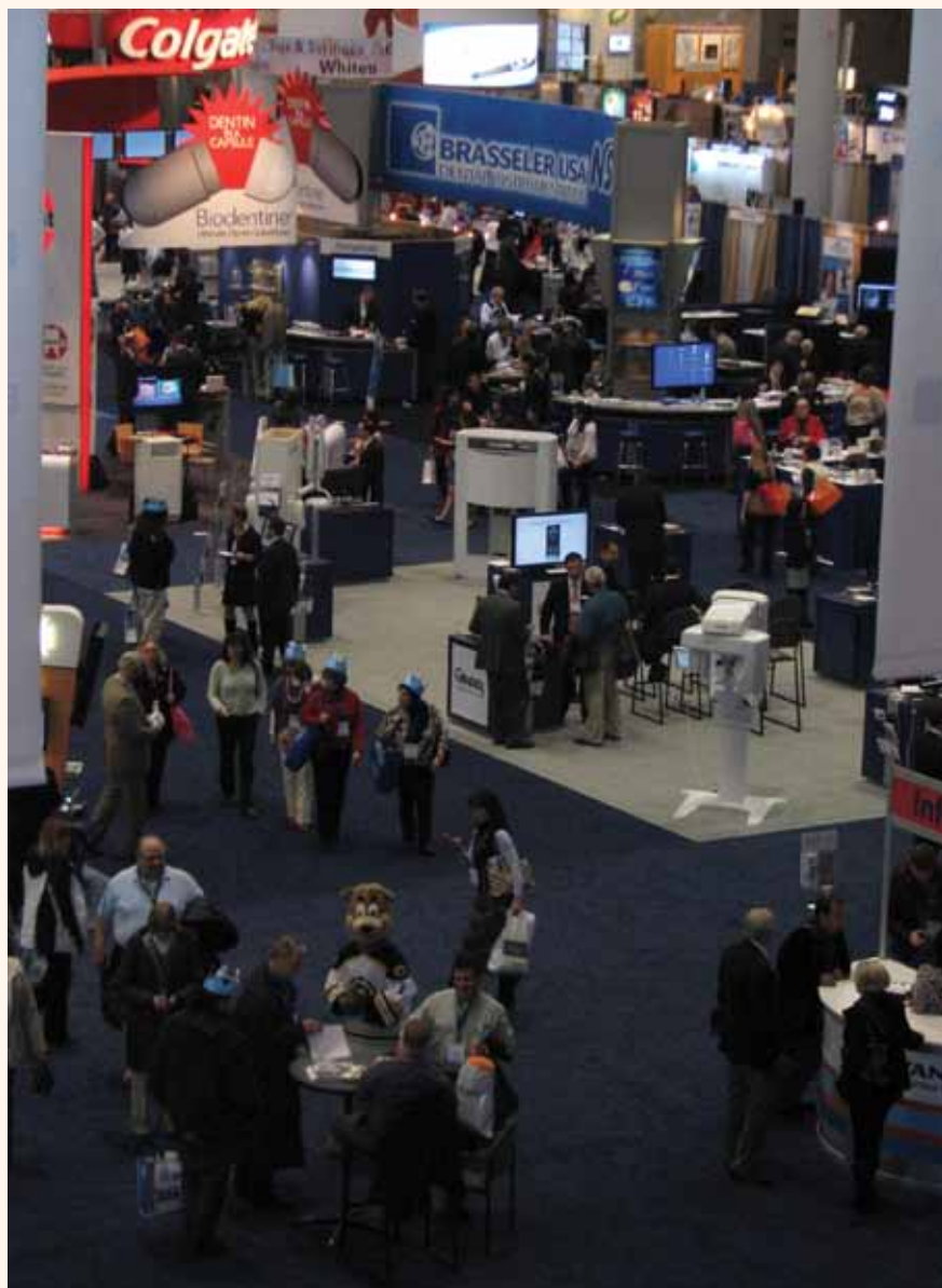
A bird's eye view of the exhibit hall on the first day of the meeting.

floor. Actual procedures were performed on patients, with close-up video providing every detail to the farthest rows of the 200-seat venue. Q&As with the dentists also were part of the concept — all of it courtesy of dental-product companies wanting to showcase their offerings in as realistic a setting as you can get.