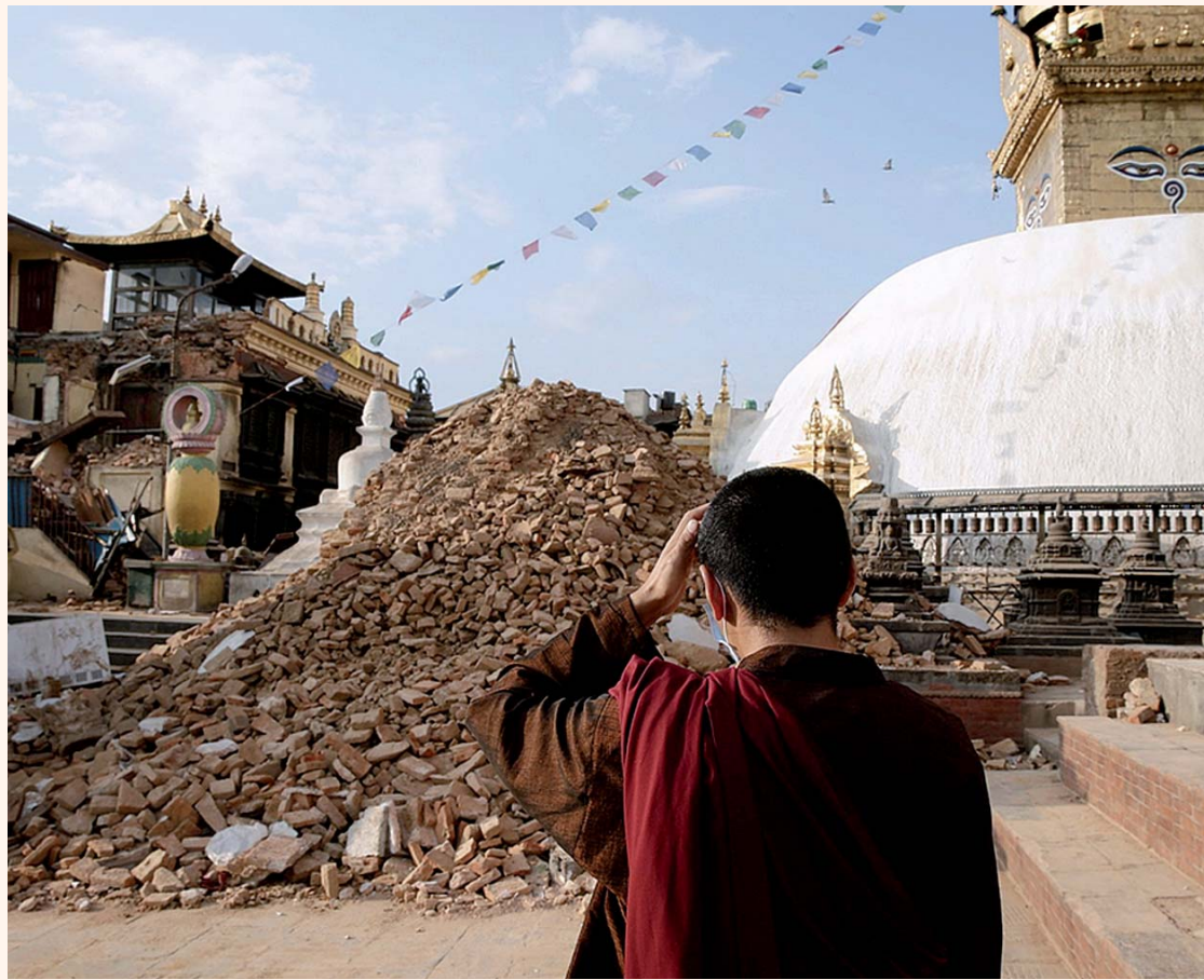
Monk looking at destruction caused by the 25 April earthquake in the Nepalese capital Kathmandu. Damages are estimated at US$200 million.

While physically my family and I are fine, we are still pretty much in shock. My children are very distressed because they were alone at home during the first episode of the earthquake. Some of my staff from the hospitals and clinics lost their houses