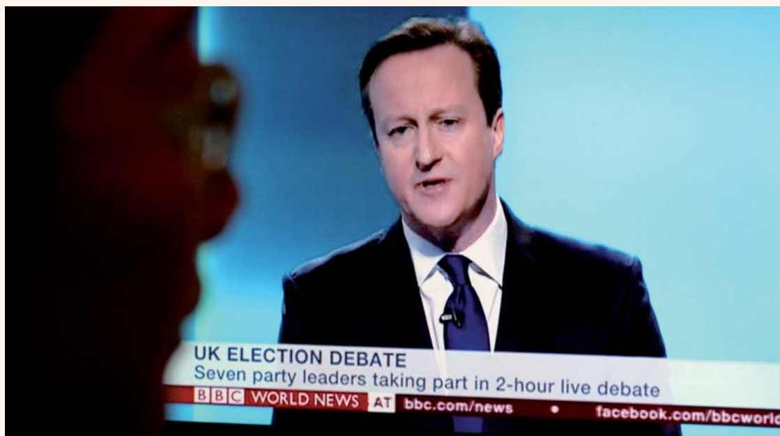
PM David Cameron during a election debate. The Conservatives will have to stand up to their promises for a 'new dentistry contract', the BDA said.

In second position, the University of Hong Kong is located in the