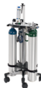
4-Cylinder Mobile Cart