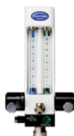
Porter Digital MXR Flowmeter