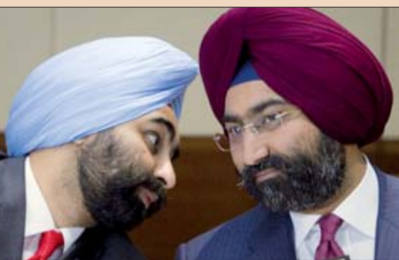
Singh brothers during a press conference in 2010.