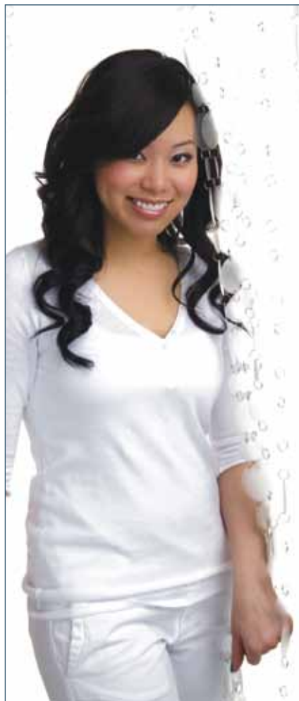
Damon Clear2 bracket offers an esthetically pleasing, completely clear and self-ligating option.

In addition to optimized standard torque brackets, Damon Clear2 features the same core design as the original Damon Clear passive self-ligating brackets, which are used with the Damon System's high-tech, light-force archwires and minimally invasive treatment protocols.