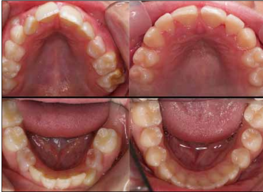
Fig. 1: A case study.