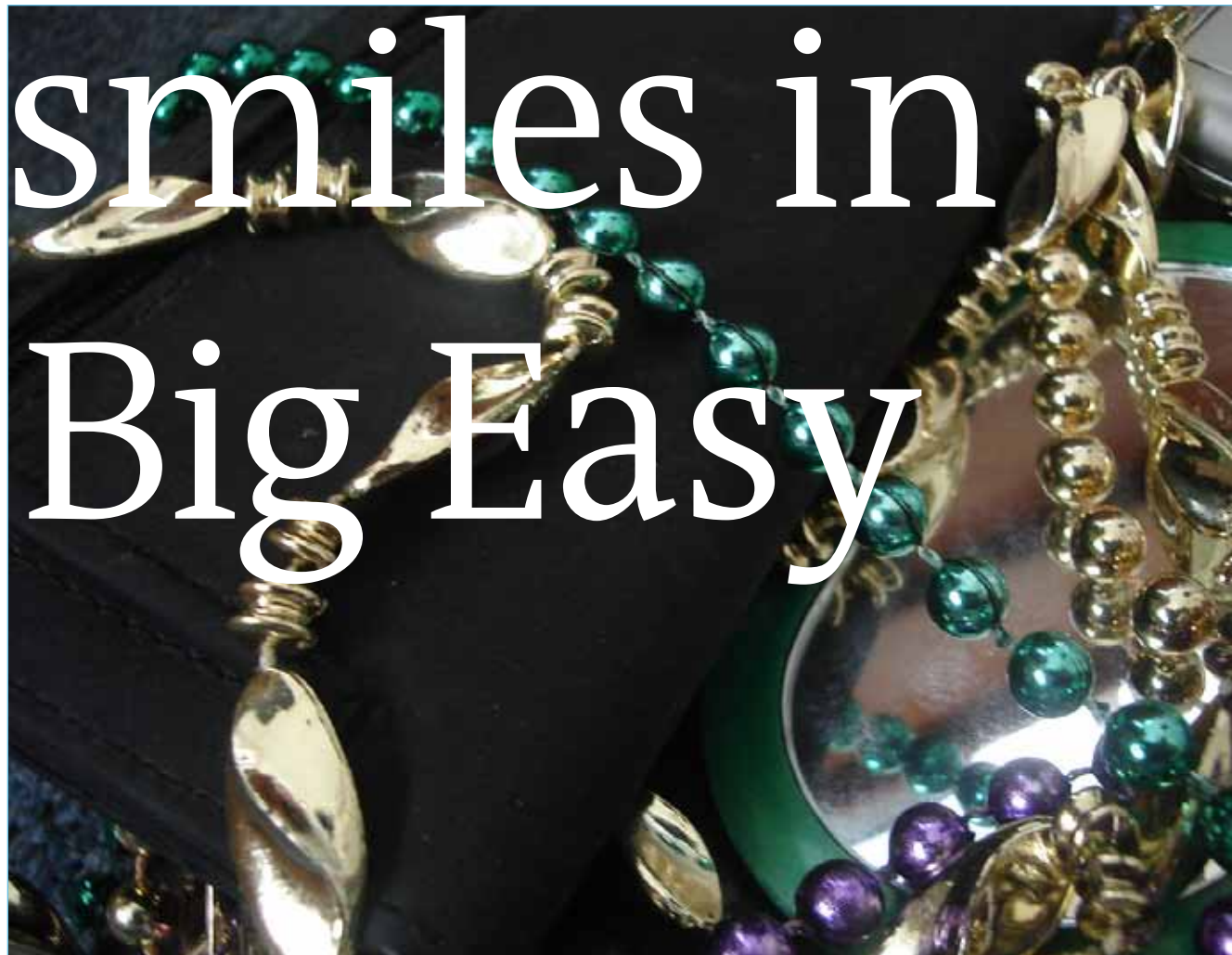
The American Association of Orthodontists will host its 2014 annual session at the Ernest N. Morial Convention Center in New Orleans, featuring keynote speaker Peyton Manning and Opening Ceremonies’ musical guest Kenny Loggins.

To kick off the week, the AAO’s Annual Session Opening Ceremonies will feature Kenny Loggins on Saturday, April 26. In addition, the AAO team expects many attendees will share in the