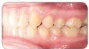
Class II to Class I in 4.5 months