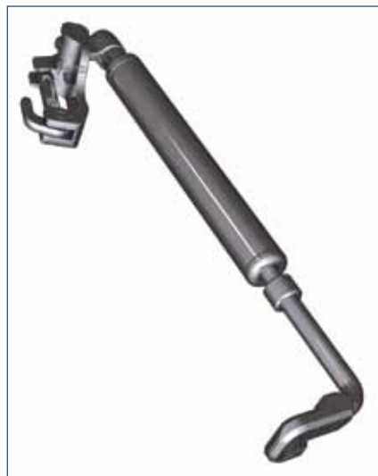
Esprit is a new Class II corrector offered by Opal Orthodontics.