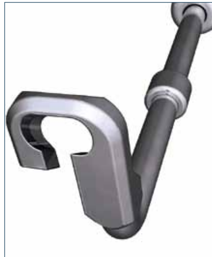
The mesial attachment for the Esprit prevents rolling into the occlusion.