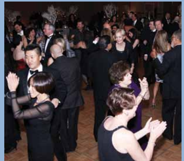
• The Greater New York Dental Meeting's annual Dinner Dance took place Saturday evening at the New York Marriot Marquis Hotel. The black-tie event featured cocktails, dinner and dancing with music provided by The Ultimate Entertainment.