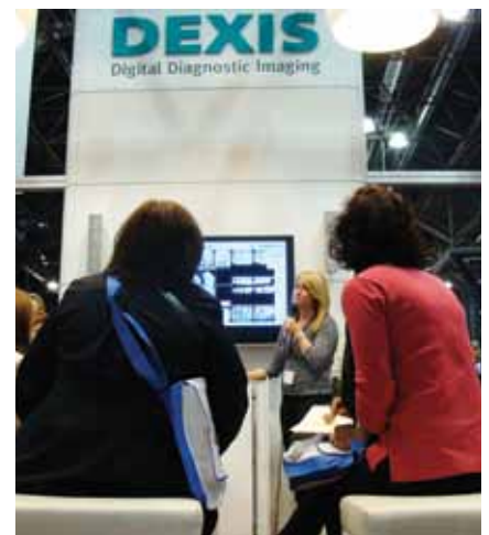
• Meeting attendees learn more about Dexis during a presentation at booth No. 4007.