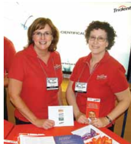
• Get your sugarless gum at the Trident booth (No. 5604).