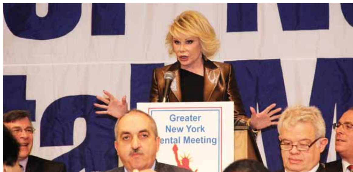
Joan Rivers speaks during the Celebrity Luncheon on Monday.