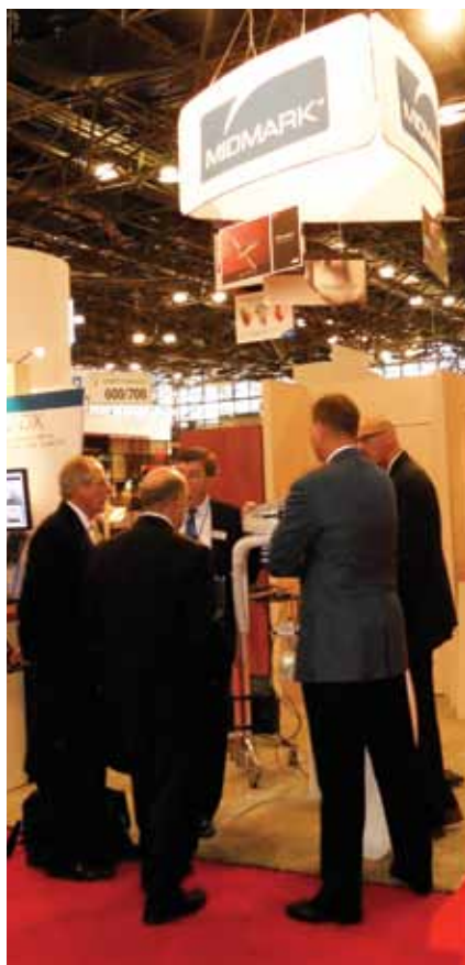
• GNYDM attendees gather around the Midmark booth (No. 217) to admire the lush seating.