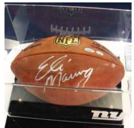
• Find out how you can have a football signed by Eli Manning at the Aseptico booth (No. 807).