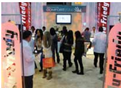
• Step into the "Comfort Zone" at Hu-Friedy Mfg. Co. (booth No. 1403).