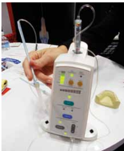
• Milestone has many specials available at the GNYDM. Stop by the booth (No. 2911) and ask about the High Production package (hint: you'll get five free boxes)!