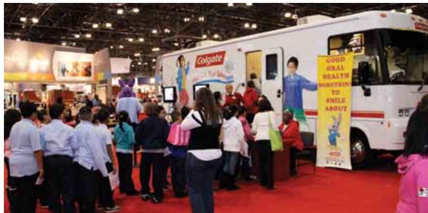
• New York public school children enjoy the Greater New York Smiles Children's Program on Monday, which aimed to instruct and demonstrate the importance of oral health care to local youth.