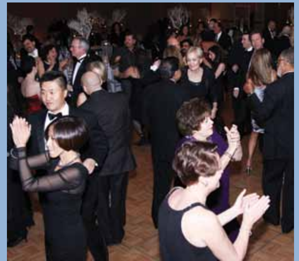
• The Greater New York Dental Meeting's annual Dinner Dance took place Saturday evening at the New York Marriot Marquis Hotel. The black-tie event featured cocktails, dinner and dancing with music provided by The Ultimate Entertainment.