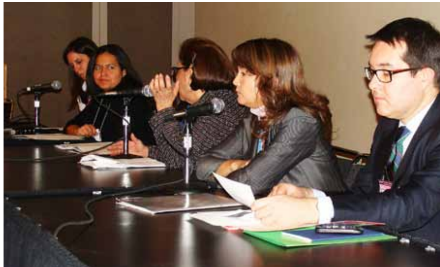
• International Commercial Specialists discuss exporting during a Monday seminar sponsored by the United States Department of Commerce.

As a special feature of the meeting, the international business center meets the needs of manufacturers and dealers who are interested in exporting their products. It is located in the registration area of the Jacob K. Javits Convention Center and is open during registration hours.