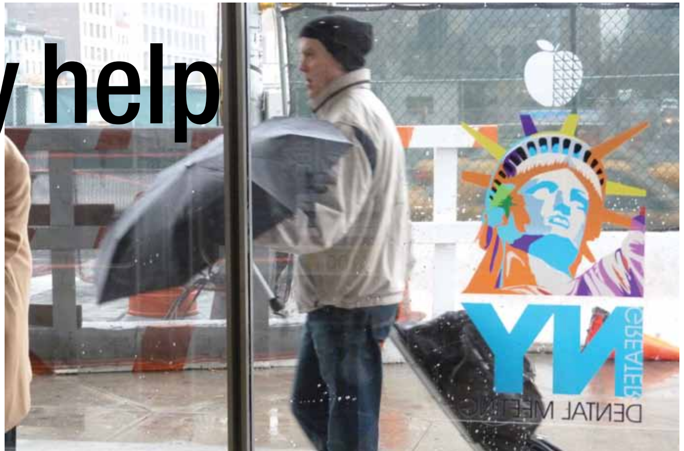
Umbrellas, raincoats and newspapers-over-the-head are standard attire for Greater New York Dental Meeting attendees arriving at the Jacob K. Javits Convention Center on Tuesday morning.

For those heading straight to the exhibit hall, among the many event specials available yesterday (and again today) were opportunities for dental professionals affected by Hur-