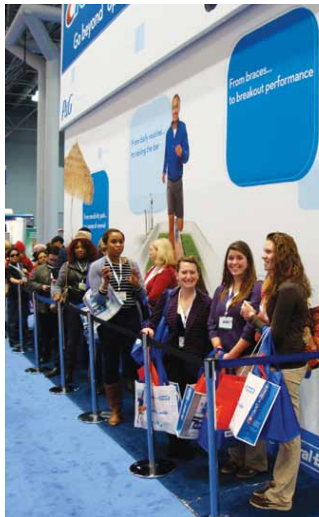
• Meeting attendees line up for the presentation at Crest Oral-B (booth No. 4225).