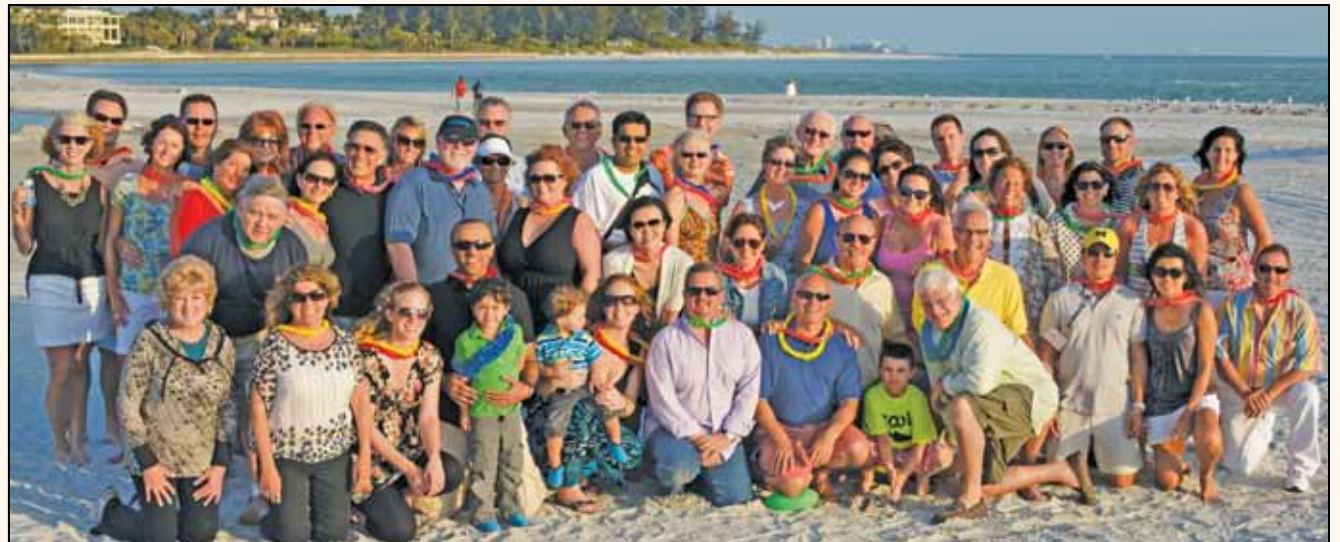
Attendees at the 2013 Smiles In The Sun Seminar, on the beach in Longboat Key, Fla.