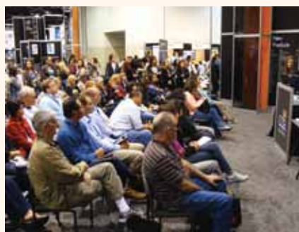
The Spot is a great place to sit down and relax — and learn something at the same time.