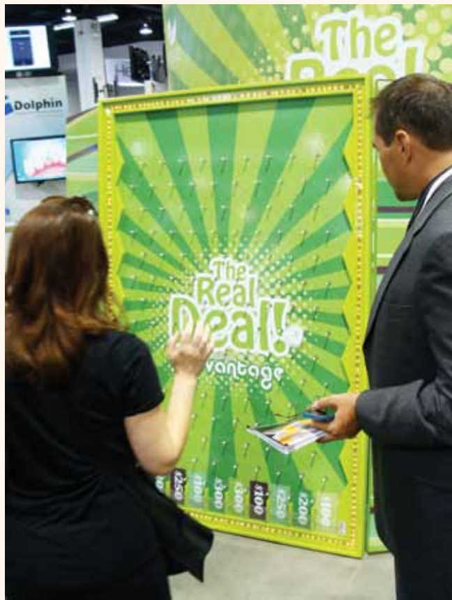
Those who are enrolled in the Advantage Program with Patterson Dental Supply can stop by the booth (No. 434) to play a Price-Is-Right-style game.