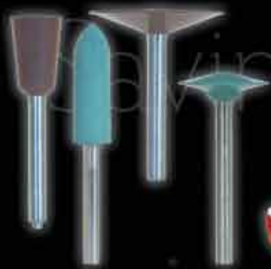
Brownie® & Greenie® Pre-Polishing & Polishing