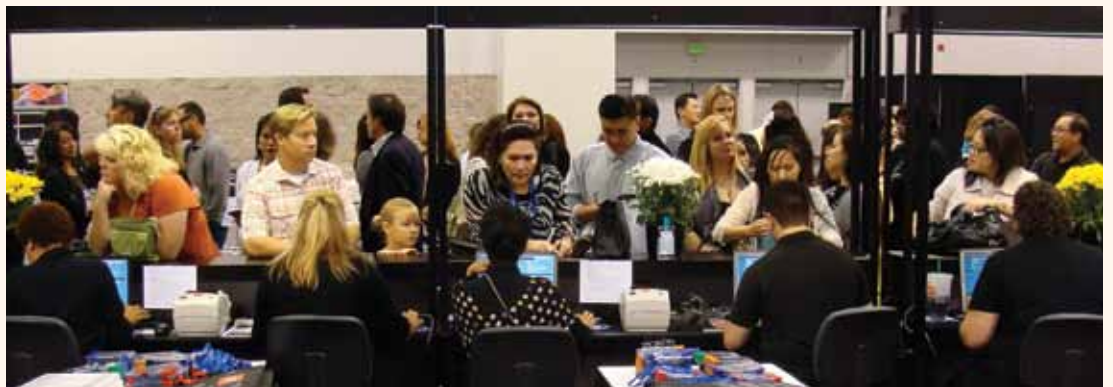
The folks behind the registration counter take care of meeting attendees on Friday morning.