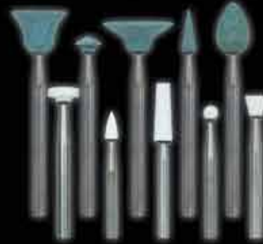
Dura-Green® & Dura-White® Contouring & Finishing