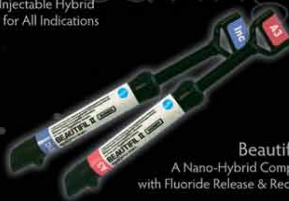
Beautifil® II A Nano-Hybrid Composite with Fluoride Release & Recharge