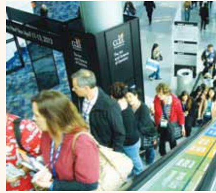
Here at CDA, it's up the escalators to the lectures and workshops.