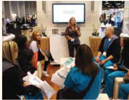
Meeting attendees learn about digital imaging at the Dexis booth (No. 1646)