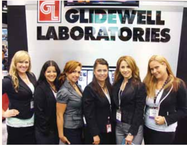
The team members at Glidewell Laboratories (booth No. 1444) are all smiles.