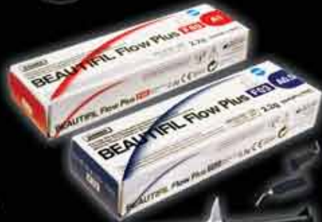
Beautifil Flow Plus® Finally, an Injectable Hybrid Restorative for All Indications