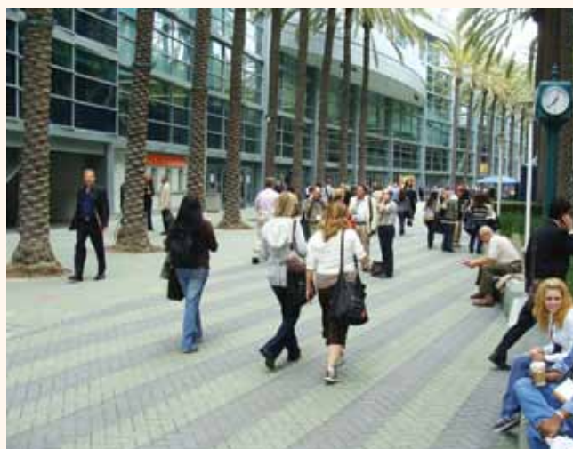
During the CDA meeting, it's always nice to step outside for some Southern California sunshine.