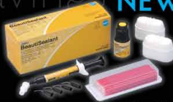
BeutiSealant™ Fluoride Releasing Pit & Fissure Sealant