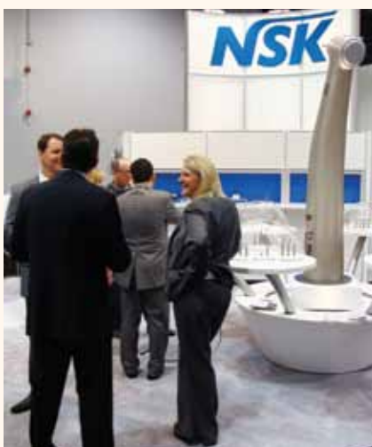
The NSK Dental booth (No. 140).