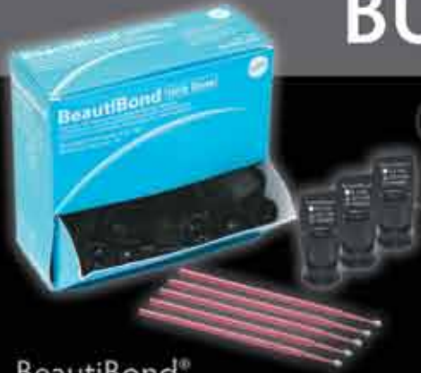
BeutiBond® One Adhesive: Two Powerful Monomers