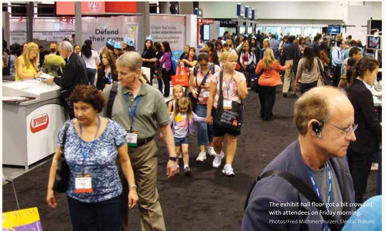
The exhibit hall floor got a bit crowded with attendees on Friday morning.