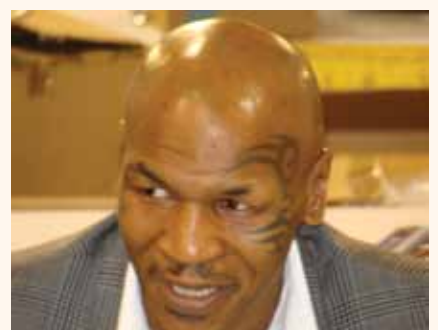
Mike Tyson was signing boxing gloves on Friday at the Glove Club (booth No. 832).