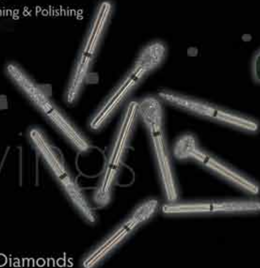
Robot® Diamonds Precise Diamond Particles Delivering Exceptional Results