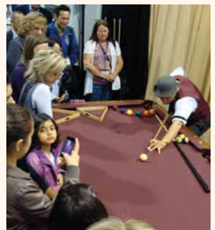
A pool shark shows 'em how it's done at ProSites (booth No. 1359).