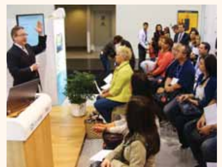
Meeting attendees listen to an educational presentation about Invisalign therapy at the Align Technologies booth (No. 2044).