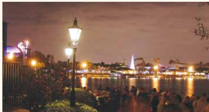
The city of Orlando shimmers in the background.

Literally, what you will hear is the "future" of dentistry, and those that jump on the train early will be light years ahead of other dentists in the field who only attend other meetings.