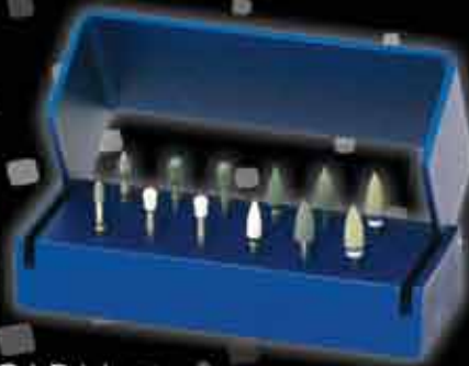
CADMaster® Porcelain Finishing & Polishing