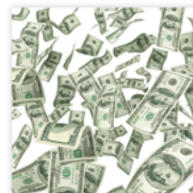
Exclusive Show Promotions

Supplies | Equipment | Practice Management Systems | Digital Technology | Technical Service | Business Solutions