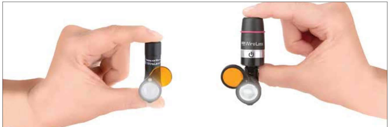
• The LED DayLite WireLess Mini and LED DayLite WireLess headlights.

Best of all, the LED DayLite WireLess headlights can be easily transferred from one platform to another, expanding your WireLess illumination possibilities across your eyewear options.