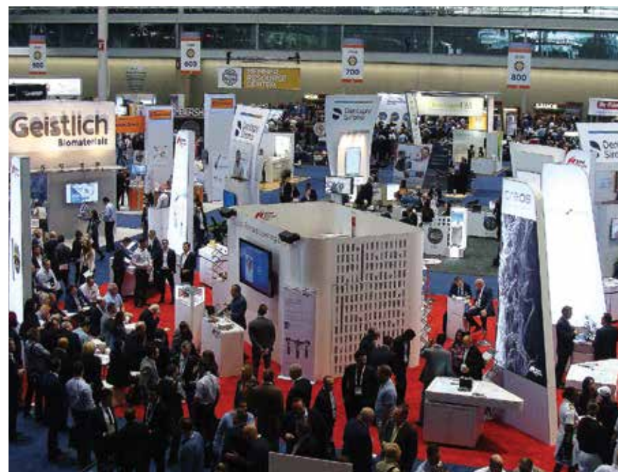
• Attendees stroll the exhibit hall floor during the 2017 AAP Annual Meeting.