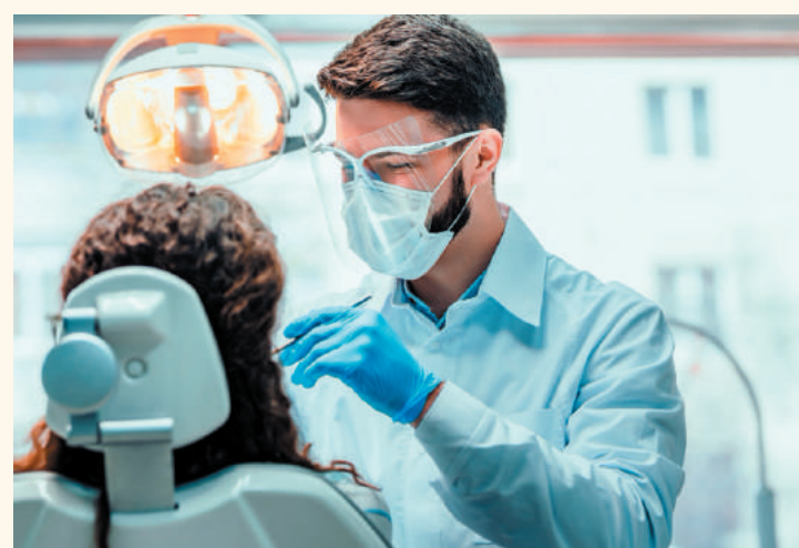
The Umbrella soft tissue retractor has been developed for the caring clinician. It's a more comfortable retraction for your patient and maintains optimal, stable access to the working environment.

Patients no longer have to feel the anxiety of opening wide—there's a cheek retractor that respects the mouth and the access needs of the clinician. DT