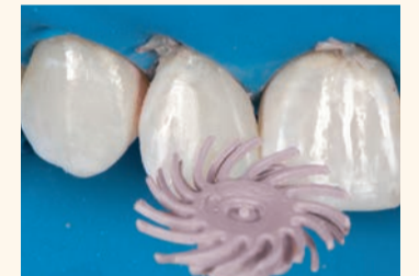
Fig. 9. Second, a pink diamond polishing spiral then imparted a smooth, high-gloss polish (Fig. 9). These spirals easily adapted to all surfaces. Finally, the proximal surface was polished with finishing strips.