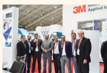
3M Oral Care at SDS

And with the Efficient Restorative Procedure solution 3M helps to simplify posterior restorations, one of the most common and complicated procedures. By using four 3M innovative technologies together (Filtek™ Bulk Fill Posterior restorative, Single Bond Universal adhesive, Elipar DeepCure curing light and Sof-Lex™ Diamond Polishing System) dentists can now move through a posterior restoration with speed and simplicity. Essential to this simpli-