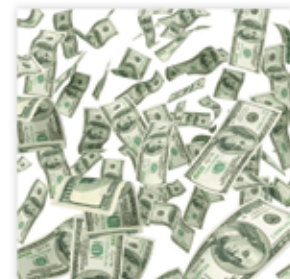
Exclusive Show Promotions

Supplies | Equipment | Practice Management Systems | Digital Technology | Technical Service | Business Solutions