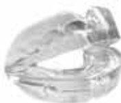
HealthyStart ® C Series