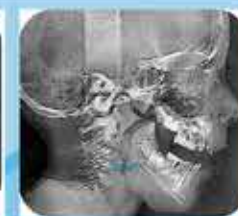
AIRWAY IMPACTED BY MOUTH BREATHING

15% OF MOUTH OPENING = 6 MM OF AIRWAY REDUCTION