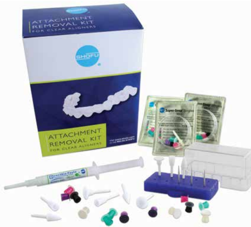
The Attachment Removal Kit for Clear Aligners.

scratch-resistant, and it can be swiftly disinfected with a sterilizing towelette, virtually eliminating the possibility of cross-contamination.