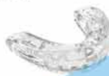
HealthyStart ® IG or G Series

WWW.THEHEALTHYSTART.COM WWW.OPENAIRWAYORTHODONTICS.COM