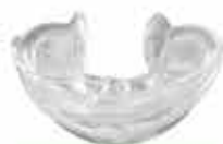
HealthyStart ® Pado Habit Corrector