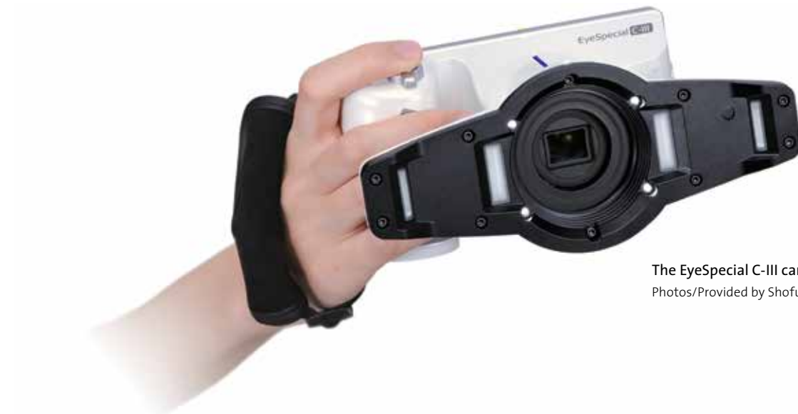
The EyeSpecial C-III camera.

Engineered to provide functionality, the ultralight (weighing ca. 1 lb) EyeSpecial C-III complies with infection control protocols. The heavy-duty camera's body is water-, chemical- and