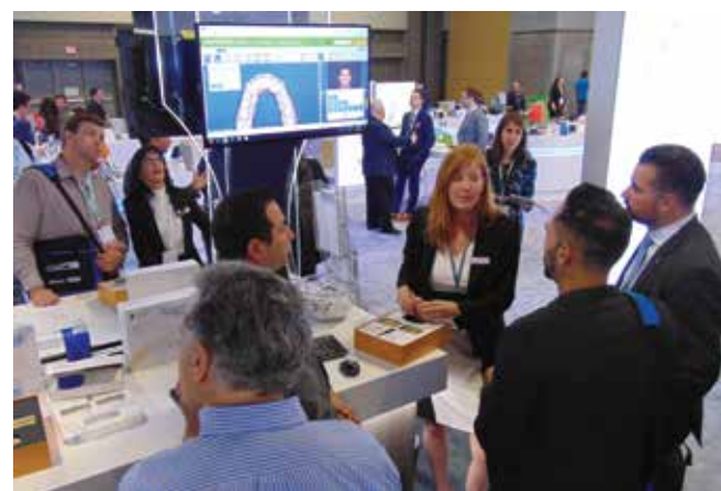
Meeting attendees get more information about the SureSmile aligner system at the Dentsply Sirona Orthodontics booth (No. 901).