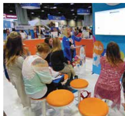
Meeting participants attend an educational presentation at PracticeGenius (booth No. 2333).