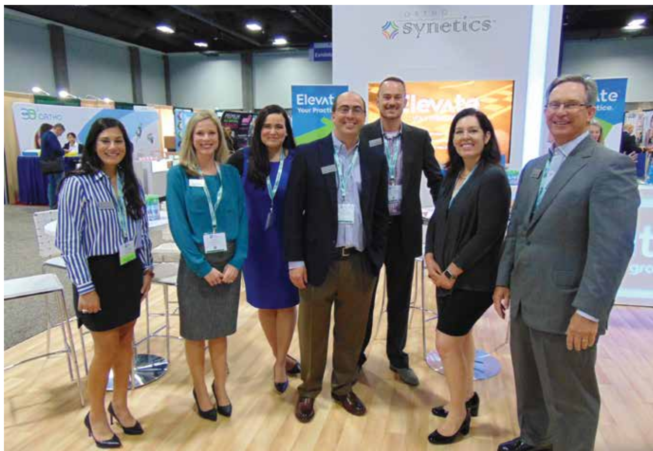
The gang at OrthoSynetics (booth No. 2137).