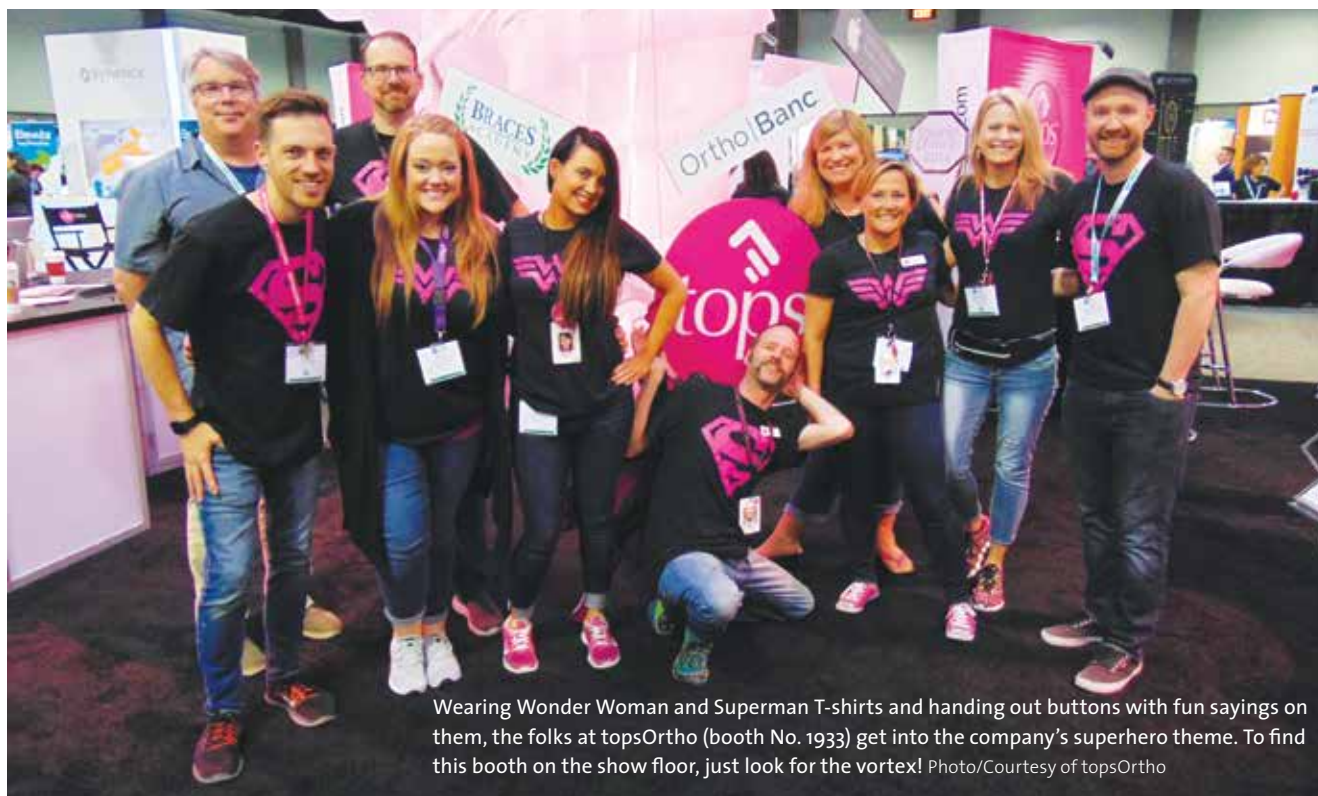
Wearing Wonder Woman and Superman T-shirts and handing out buttons with fun sayings on them, the folks at topsOrtho (booth No. 1933) get into the company's superhero theme. To find this booth on the show floor, just look for the vortex!