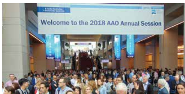
The Walter E. Washington Convention Center is filled with orthodontic professionals Saturday morning, at the beginning of the 2018 AAO Annual Session.