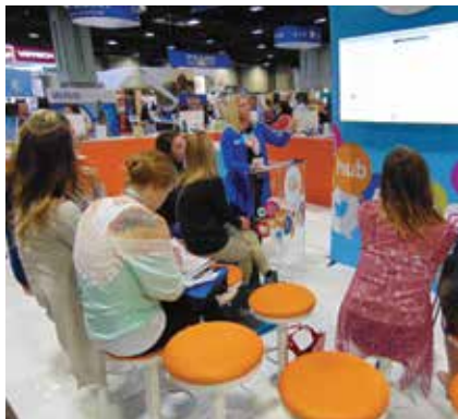
Meeting participants attend an educational presentation at PracticeGenius (booth No. 2333).