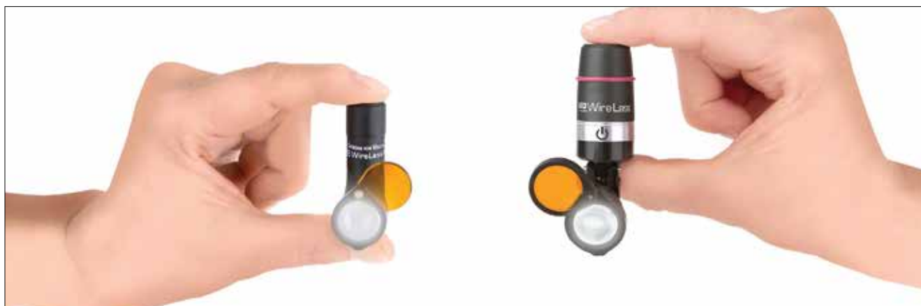
• The LED DayLite WireLess Mini and LED DayLite WireLess headlights.

Best of all, the LED DayLite WireLess headlights can be easily transferred from one platform to another, expanding your WireLess illumination possibilities across your eyewear options.