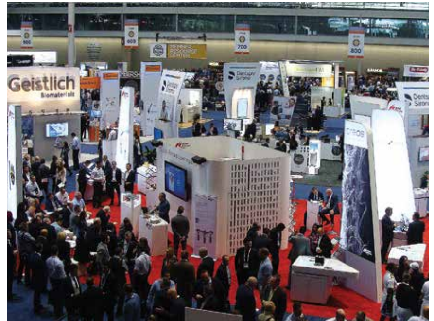
• Attendees stroll the exhibit hall floor during the 2017 AAP Annual Meeting.