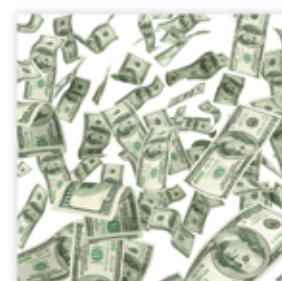
Exclusive Show Promotions

Supplies | Equipment | Practice Management Systems | Digital Technology | Technical Service | Business Solutions