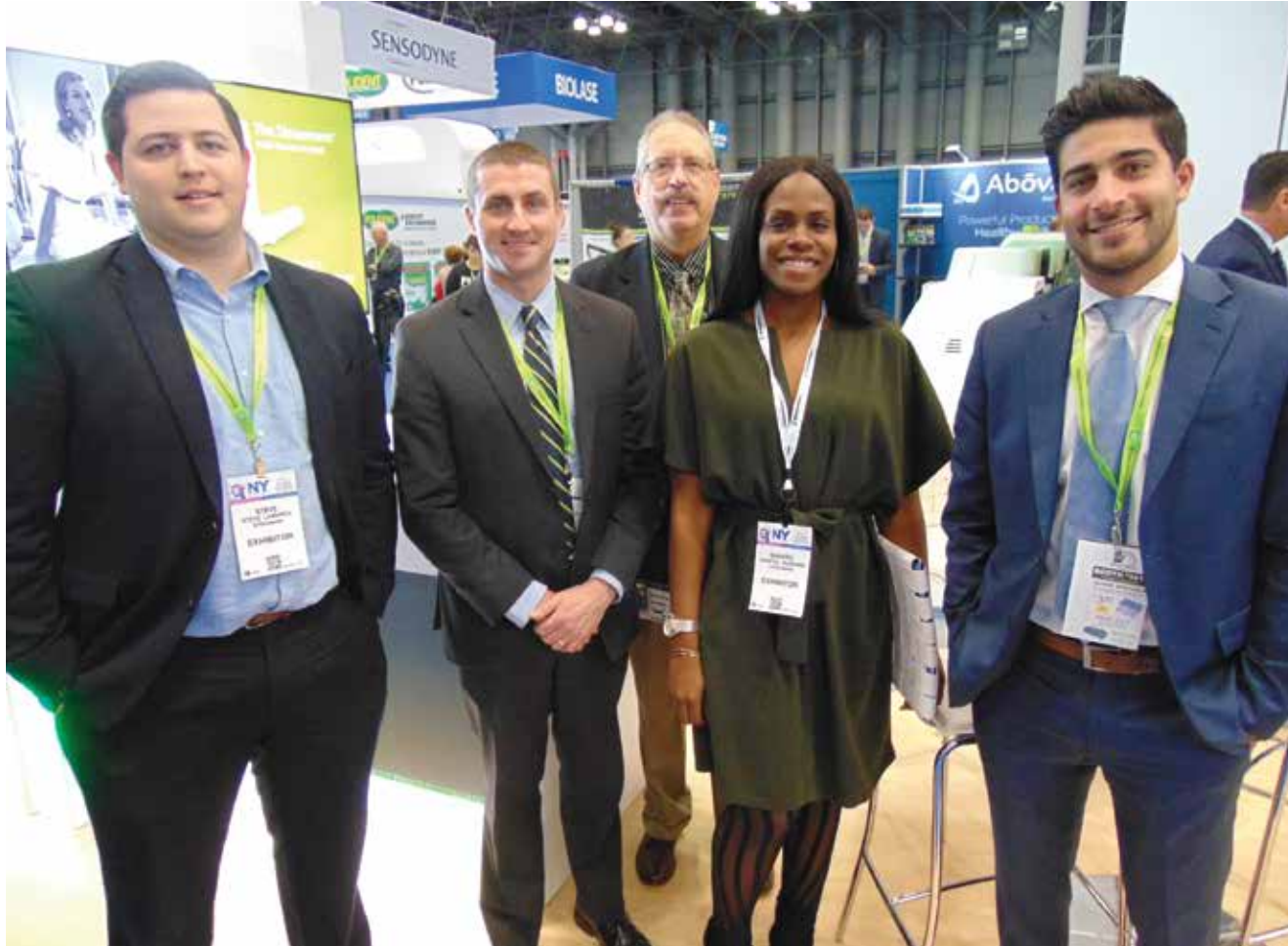
• The reps at the Straumann booth (No. 1024).