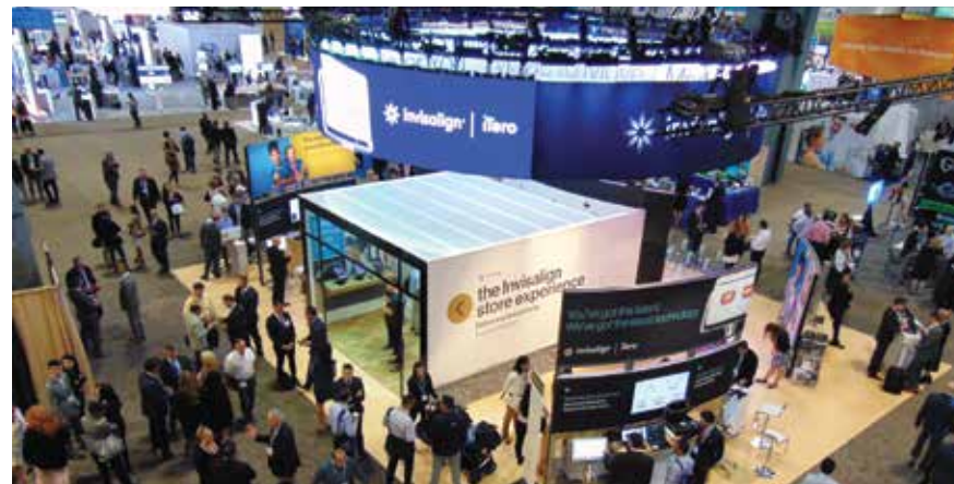
Orthodontic professionals visit the AAO exhibit hall Sunday morning.