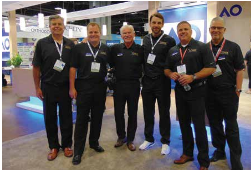
The gang at American Orthodontists (booth No. 1319).