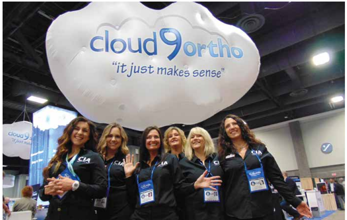
The team members at Cloud 9 ortho (booth No. 2533) have plenty to smile about.