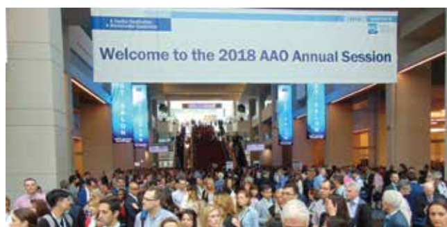
The Walter E. Washington Convention Center is filled with orthodontic professionals Saturday morning, at the beginning of the 2018 AAO Annual Session.