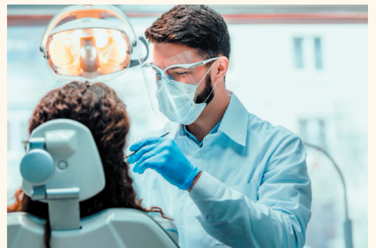
The Umbrella soft tissue retractor has been developed for the caring clinician. It's a more comfortable retraction for your patient and maintains optimal, stable access to the working environment.

Patients no longer have to feel the anxiety of opening wide—there's a cheek retractor that respects the mouth and the access needs of the clinician. DVI