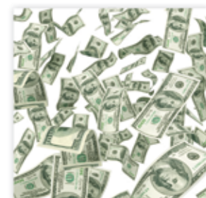
Exclusive Show Promotions

Supplies | Equipment | Practice Management Systems | Digital Technology | Technical Service | Business Solutions