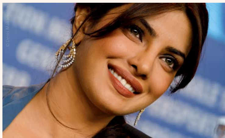
Priyanka Chopra at a film premiere in 2012. The Bollywood actress and former Miss World was recently named brand ambassador by Colgate-Palmolive in India.

Despite affecting a vast number of people worldwide, sound epidemiologic data on halitosis is rare. While 9 in 10 cases of halitosis are attributable to tongue coating, gingivitis, periodontitis and other conditions in the oral cavity, a minority of cases are caused by systemic diseases or conditions.