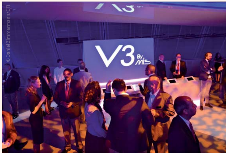
The launch event took place at the Science Museum in London.

"MIS is immensely proud of our innovative position in the global implants industry, which has led to the development of the unique V3 implant system. It's a widely