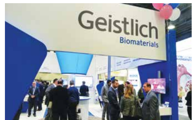
• Be sure to visit the Geistlich Biomaterials booth, No. 1117, to learn more about Fibro-Gide, a volume-stable collagen matrix designed specifically for soft-tissue regeneration.