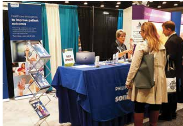
• Catch the latest from Philips Sonicare and Zoom Whitening at booth No. 1016.