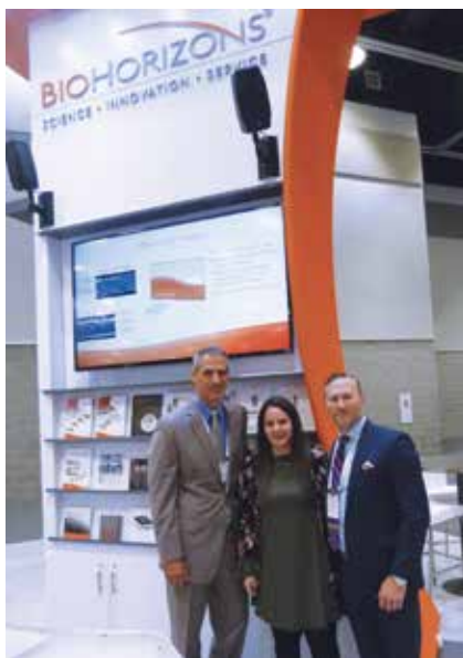
• Stop by and meet the team from BioHorizons at booth No. 1301.