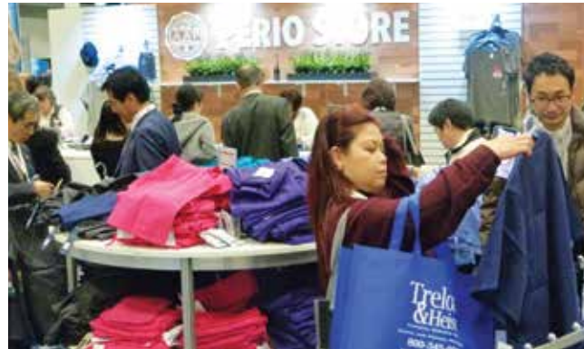
• Be sure to stop by the PerioStore to pick from a fun assortment of perio-specific swag, at booth No. 927.