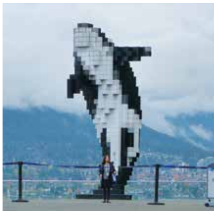
• Be sure to go out and take a selfie like this AAP attendee did with the 25-foot-tall 'Digital Orca' right outside the convention center.