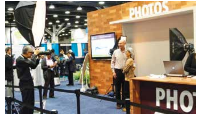
• Don't miss your chance to be styled and photographed professionally at the AAP Photo Studio at booth No. 927.