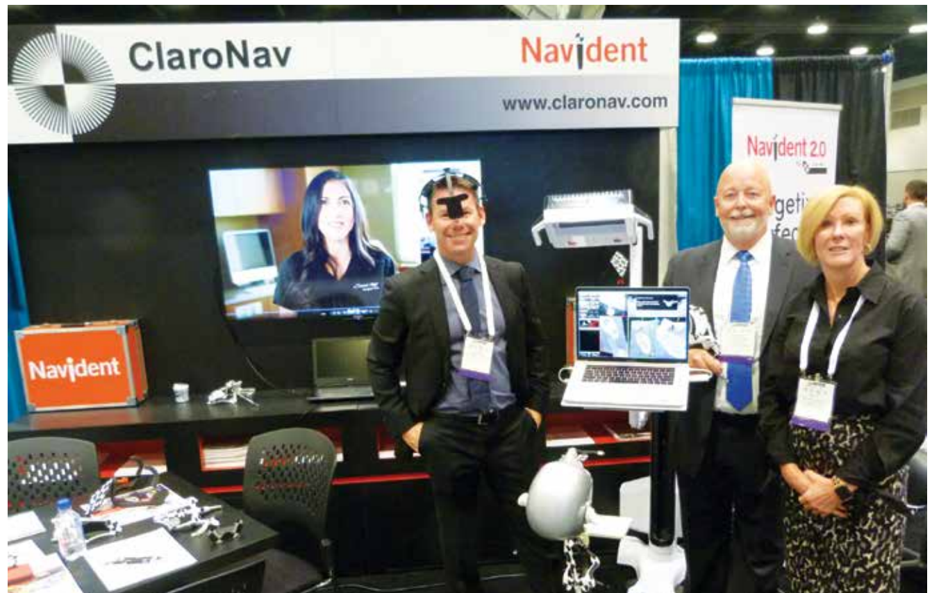
• The group from ClaroNav stands ready to give you a hands-on demonstration of the newest software from Navident at booth No. 732.