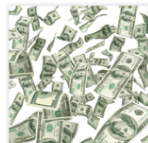
Exclusive Show Promotions

Supplies | Equipment | Practice Management Systems | Digital Technology | Technical Service | Business Solutions