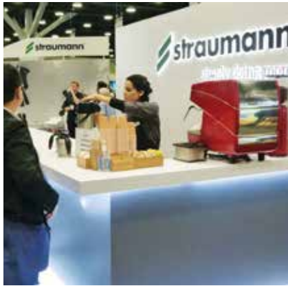
• If you need a kick of caffeine to get going, stop by the Straumann booth, No. 701, and check out the coffee bar.