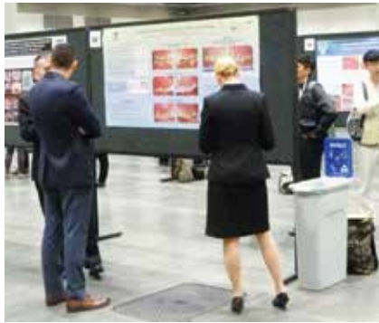
• Take time to look through the latest in perio studies at the ePoster session to the right of the exhibit hall.