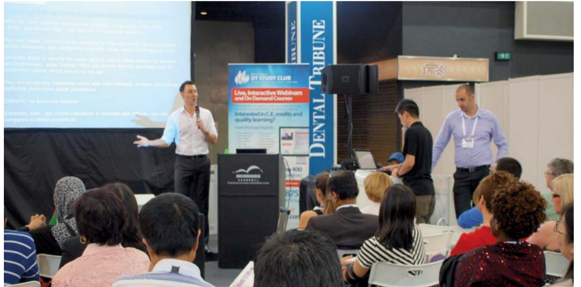
A full symposium at last year's AWDC in Hong Kong.

recognised education platform has been providing dental education to millions of dentists at international conferences and exhibitions, as well as through online lectures. More than 150,000 dentists around the world are currently members of the DT Study Club, according to DTI figures. Local platforms are available in Germany, France, Italy and Brazil,