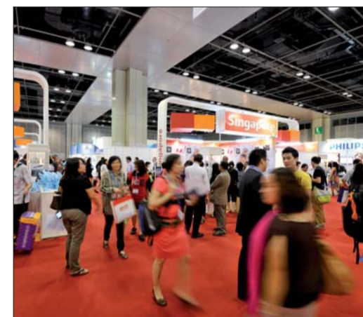
More visitors than ever were swarming the aisles of the Suntec exhibition hall in 2012