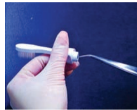
Fig. 3c: Remove the seal from the base of the toothbrush with tweezers.