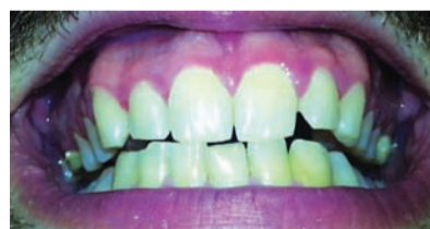
Fig. 5: Check after 7 days.