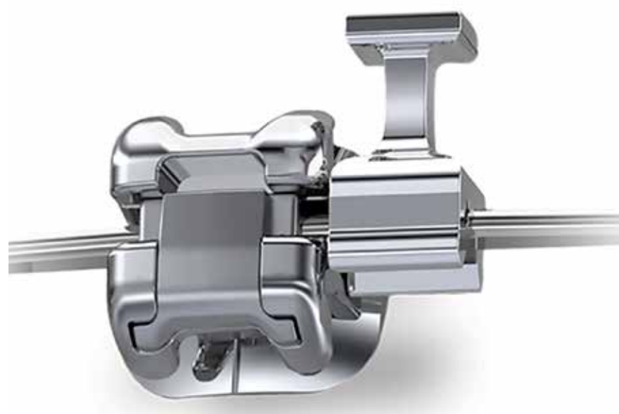
The Ultima Hook with bracket.