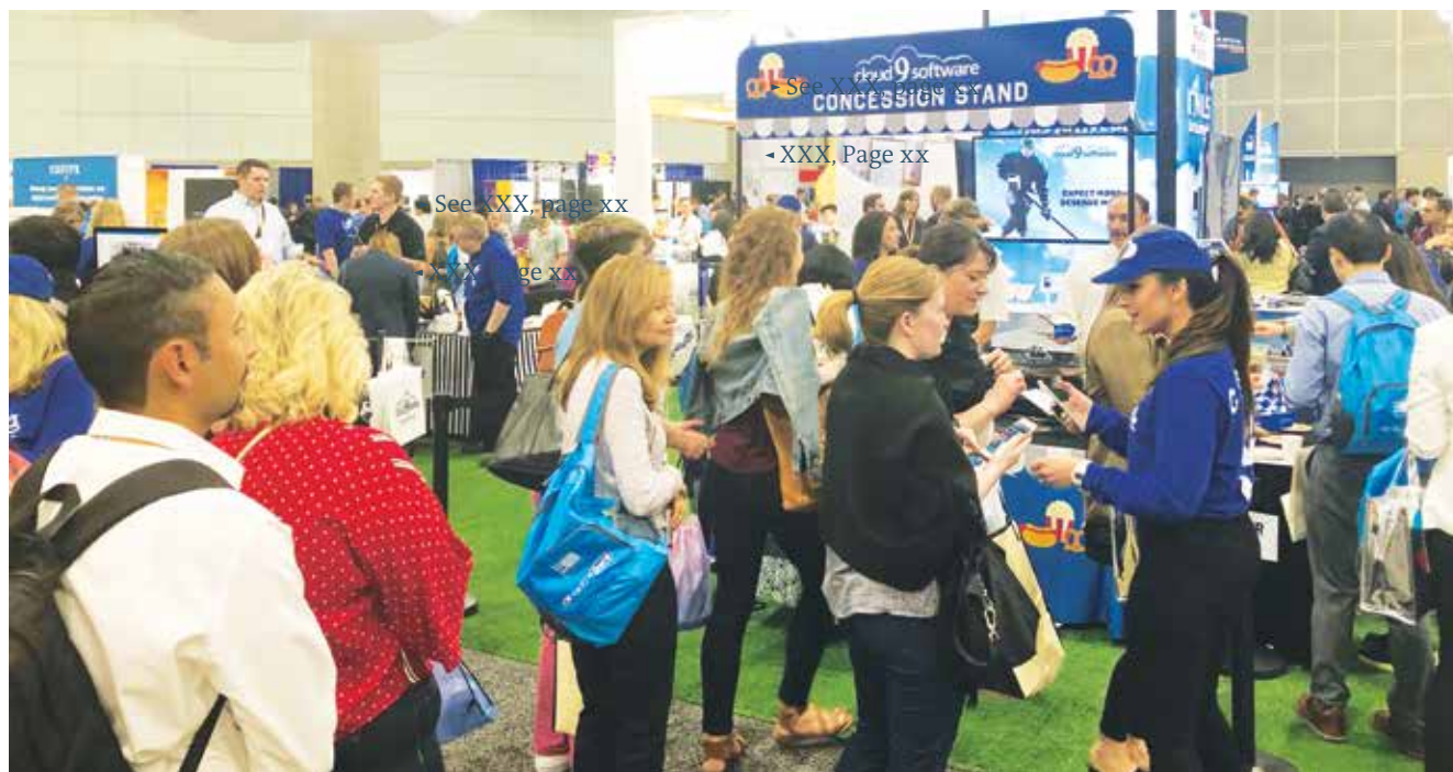
Attendees check out the Cloud9 software booth during the 2019 AAO Annual Session, held that year in Los Angeles. This year, the exhibit hall is open until 5:30 p.m. Saturday and from 8 a.m. to 4 p.m. Sunday and Monday.