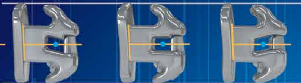
PROCLINE High Torque

Brackets are designed from the center point of the slot to line up with the FA point to express the desired torque and provide easier and more precise placement.*