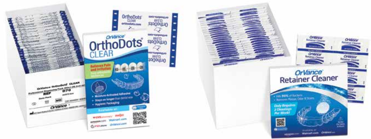
OrthoDots CLEAR and OrVance Retainer Cleaner in Professional Dispensing Packs.