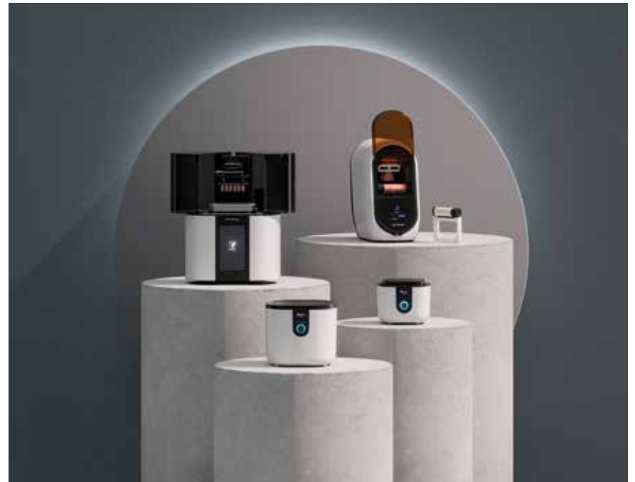
The UltraCraft ChairSide Ecosystem.

See HeyGears' UltraCraft ChairSide, ChairSide Pro, AirWash and AirCure in person at the AAO Annual Meeting at booth No. 914 in Hall A.