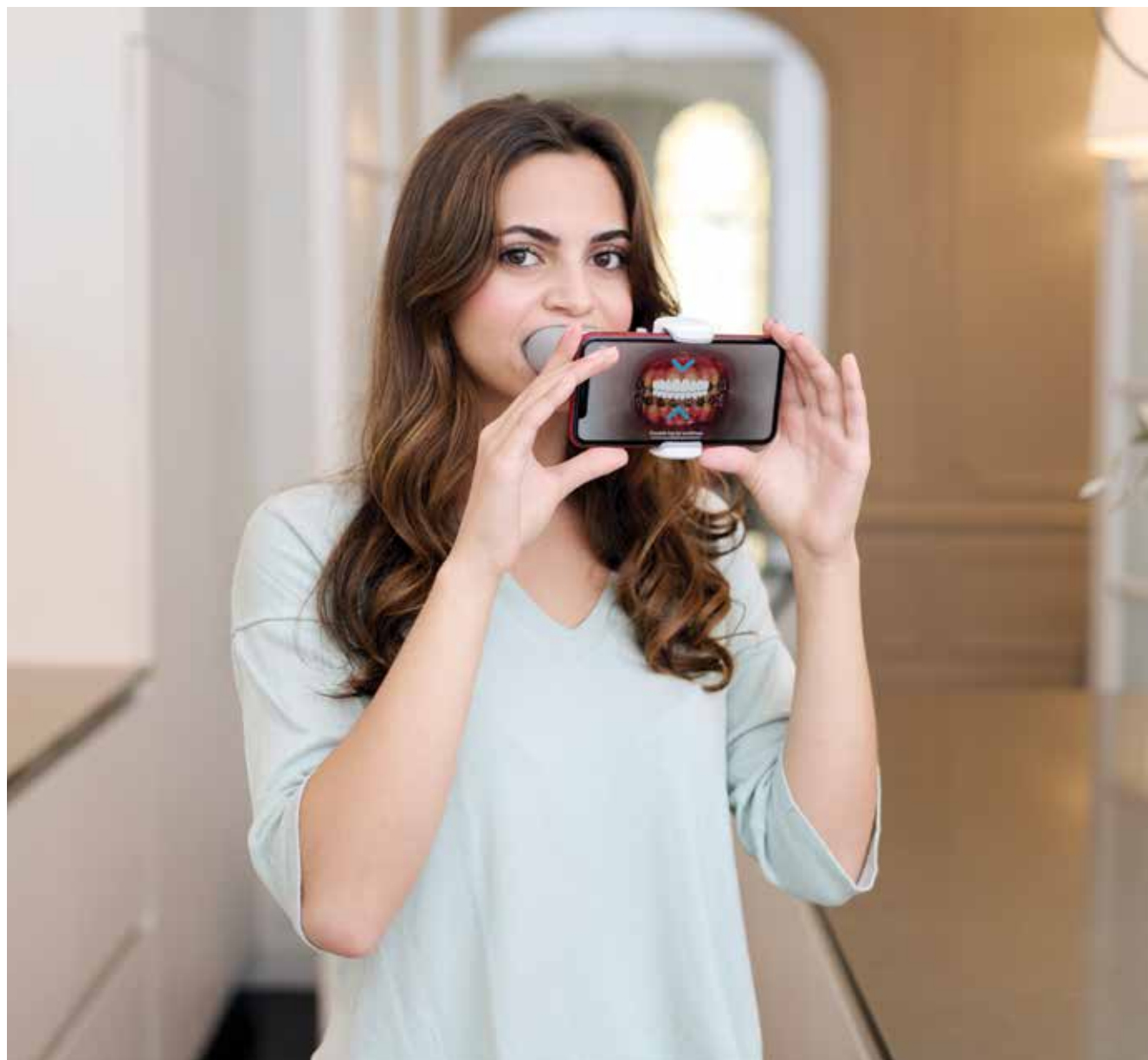
The ScanBox pro, Dental Monitoring’s latest FDA-registered innovation, is a portable device patients can take with them for precise AI-powered scans anywhere and anytime.

When backed by artificial intelligence, these remote monitoring platforms transform into powerhouses of capability by empowering providers with even greater insights, according to Dental