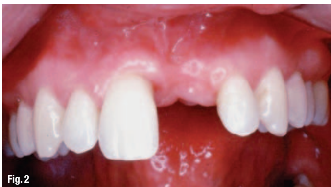
Fig. 2 _Labial view of maxillary #9 edentulous area.

_Dentists understand that patients demand outstanding aesthetic, as well as physiological, results in all phases of dentistry today. This places an onus on dentists, who must therefore be able to apply the latest technologies and techniques to achieve each patient's unique aesthetic desires successfully. A successful aesthetic outcome requires knowing how to create the right illusion, which is subjective for each individual. Yet, it can be measured in objective and subjective standards. How then can practitioners evaluate and achieve these goals?