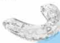
HealthyStart ® IG or G Series

WWW.THEHEALTHYSTART.COM WWW.OPENAIRWAYORTHODONTICS.COM