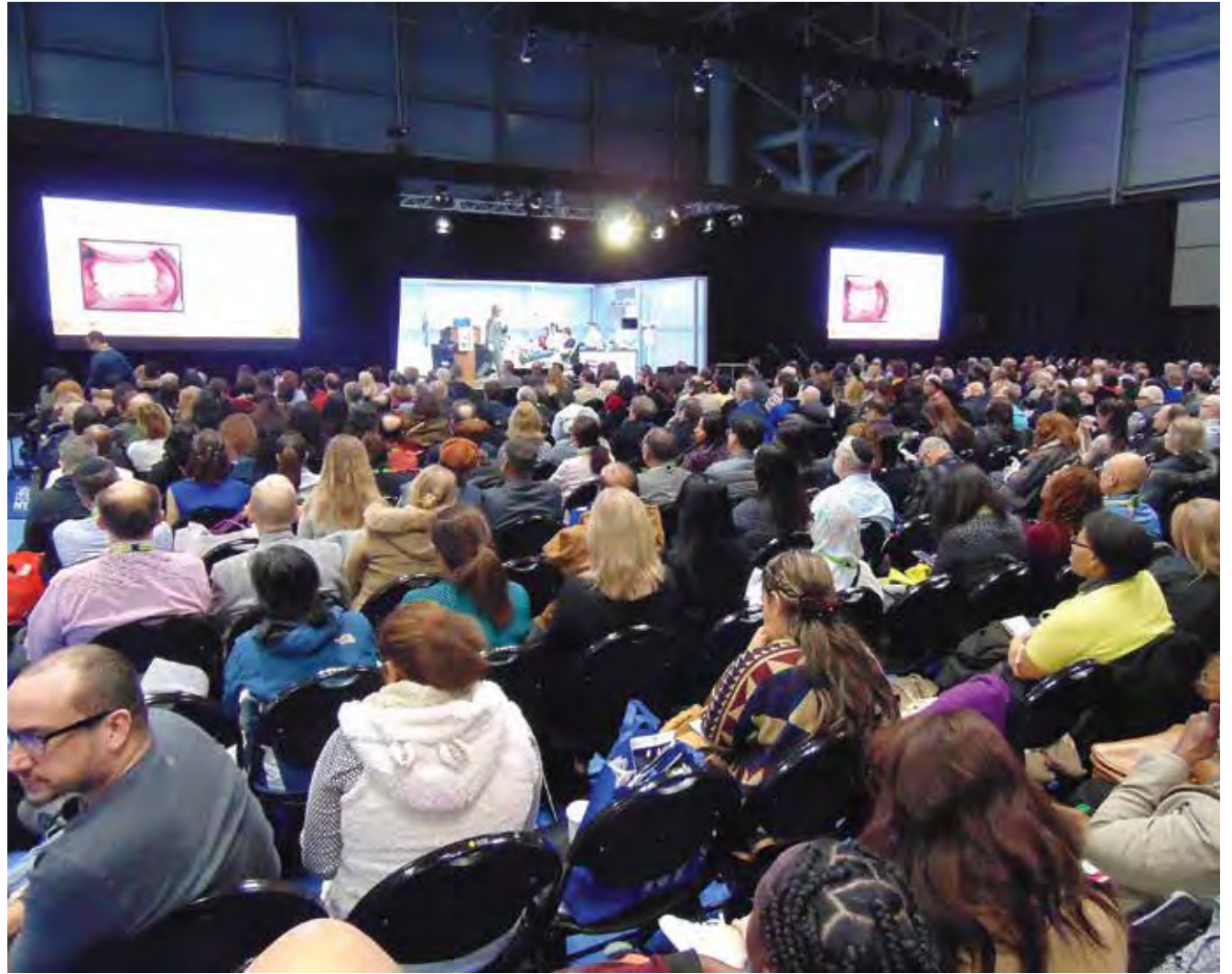
• The live dentistry arena on the exhibit hall floor is filled with meeting attendees.