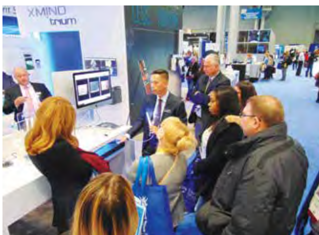
• A presenter at ACTEON North America (booth No. 4827) offers a hands-on demonstration to meeting attendees.