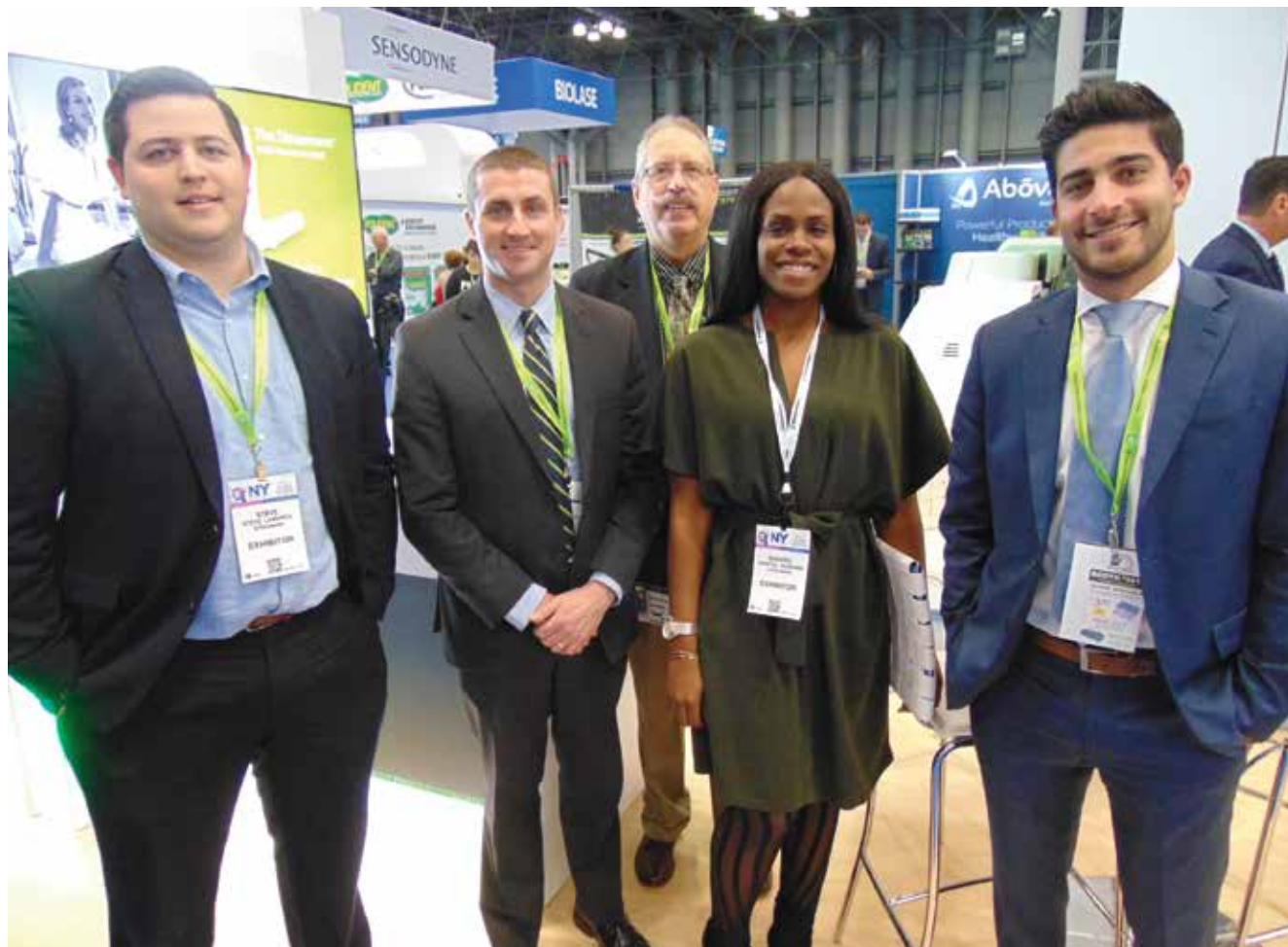
• The reps at the Straumann booth (No. 1024).