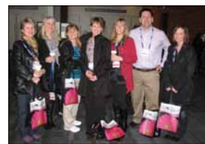
• This clinician and his staff had a rendezvous near the bag pick-up area before they went their separate ways for the day's education.