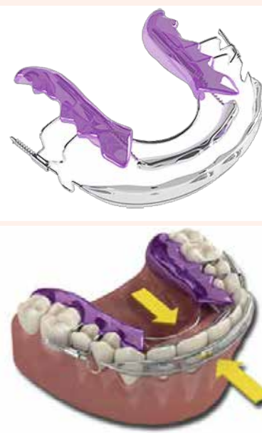
Fig. 1 The squeeze effect of the two aligner bows on the front teeth.