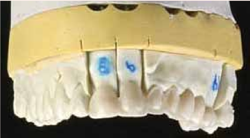
Fig.8: Full-contour zirconia cut-back to allow porcelain on the facial to increase esthetics.