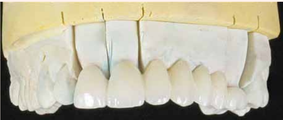
Fig.9: Porcelain facial applied to the BruxZir.