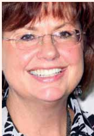
Fig. 2: Full face with the new BruxZir bridge and IPS e.max veneer on tooth #7.