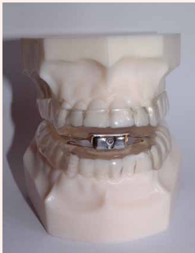
Fig.3, 4, 5: The 'Sleepwell' mandibular advancement splint.