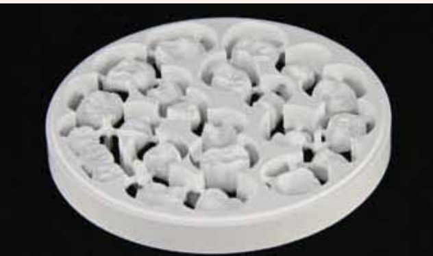
Fig.11: BruxZir disc with the crowns "nested" and fully milled.

are complete, the file is "nested" or positioned in the zirconia disk (Figs. 10, 11) and milled to a full contour approximately 30 percent larger than the final restoration. Once the restoration is milled and removed from the disk, it is dipped in the appropriate coloring solution and sintered in an oven for 6.5 hours at 1,530 degrees Celsius where it shrinks to its final size. I requested that Oral Arts e-mail me the initial design for my approval before milling (Fig. 7). The case met my expectations on design and we proceeded with fabrication. On large complex cases, I enjoy the option of approving digital case design via e-mail before case completion. After the bridge framework was sintered and checked for accuracy of fit and margins (Fig. 8), IPS e.max Ceram was stacked and baked onto the facial surfaces for enhanced esthetics. IPS e.max Ceram is a stackable ceramic powder within the IPS e.max system. The veneering ceramic is the key to highly esthetic results, both on lithium disilicate and on zirconium oxide (Fig. 9). The veneer was then waxed to a cut-back shape with mamelons, invested, burned out using the lost wax technique and pressed using IPS e.max Press lithium disilicate. Once the veneer was divested, it was layered using IPS e.max Ceram to further improve esthetics. Final delivery and cementation One of the challenges of cementing a case like this is the fact there are two dental materials side by side. Tooth #7