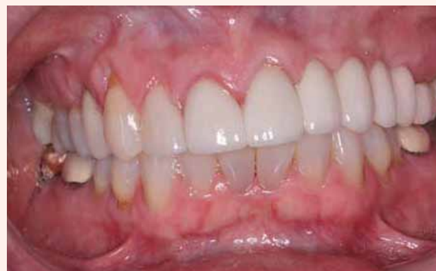
Fig. 6: Black at the gingiva is gone on this new bridge, and the gingival collar is more uniform.