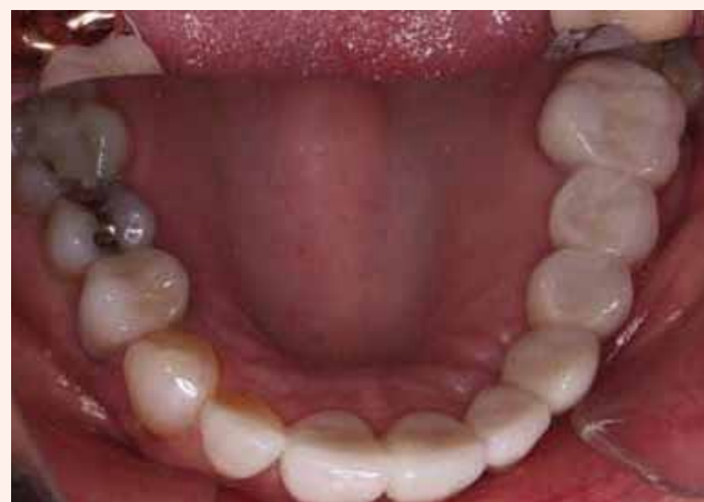
Fig. 4: Lingual of new bridge; the BruxZir material allows us to have full contour with the desired esthetics without having to reduce any more than would be required with metal.