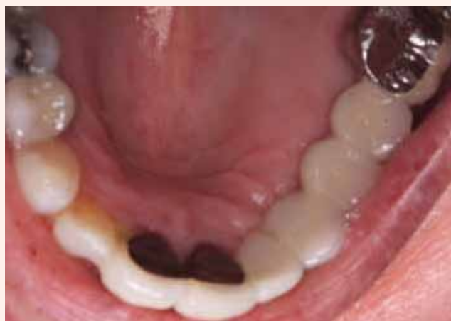
Fig. 3: Lingual of old bridge with metal lingual and occlusal surfaces on the abutments.