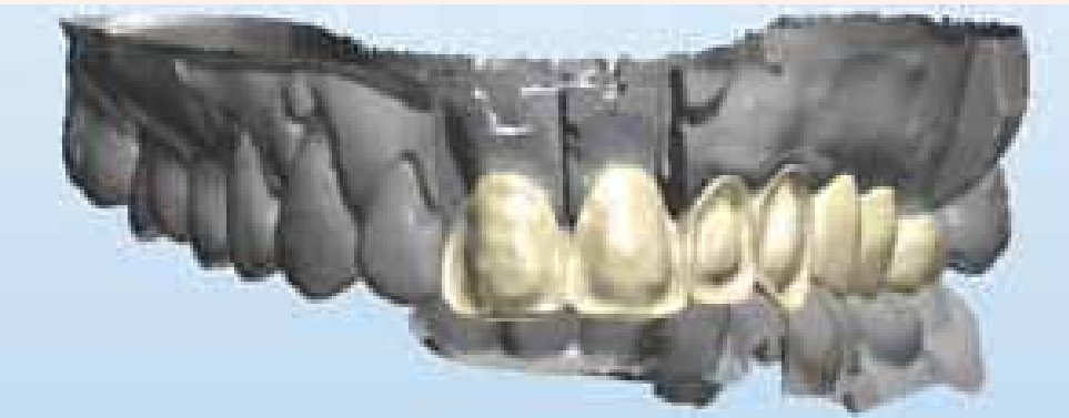
Fig.7: The screen shot of the design from Oral Arts Dental Lab in Huntsville, Ala.