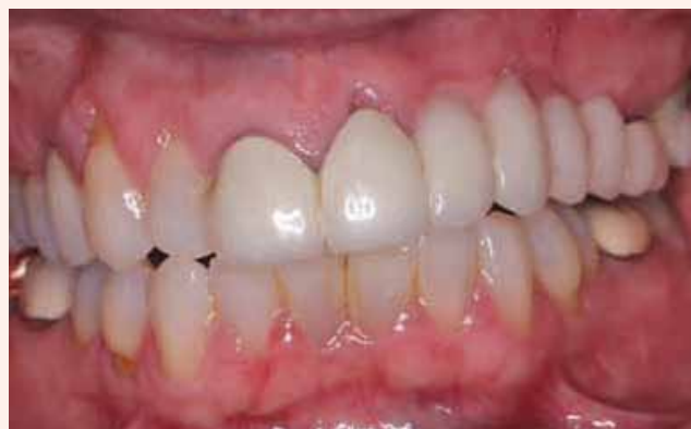
Fig. 5: Notice the porcelain repairs on the distal of tooth #8 on this old bridge.