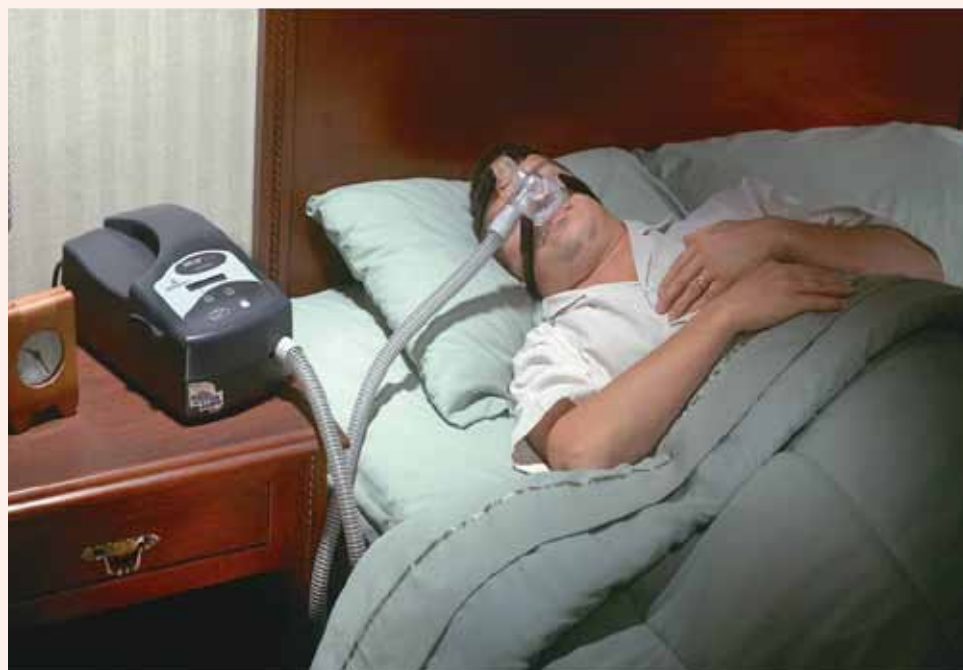
Fig.1: CPAP machine