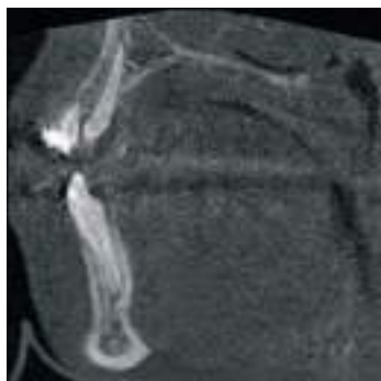
Without Planmeca CALM™